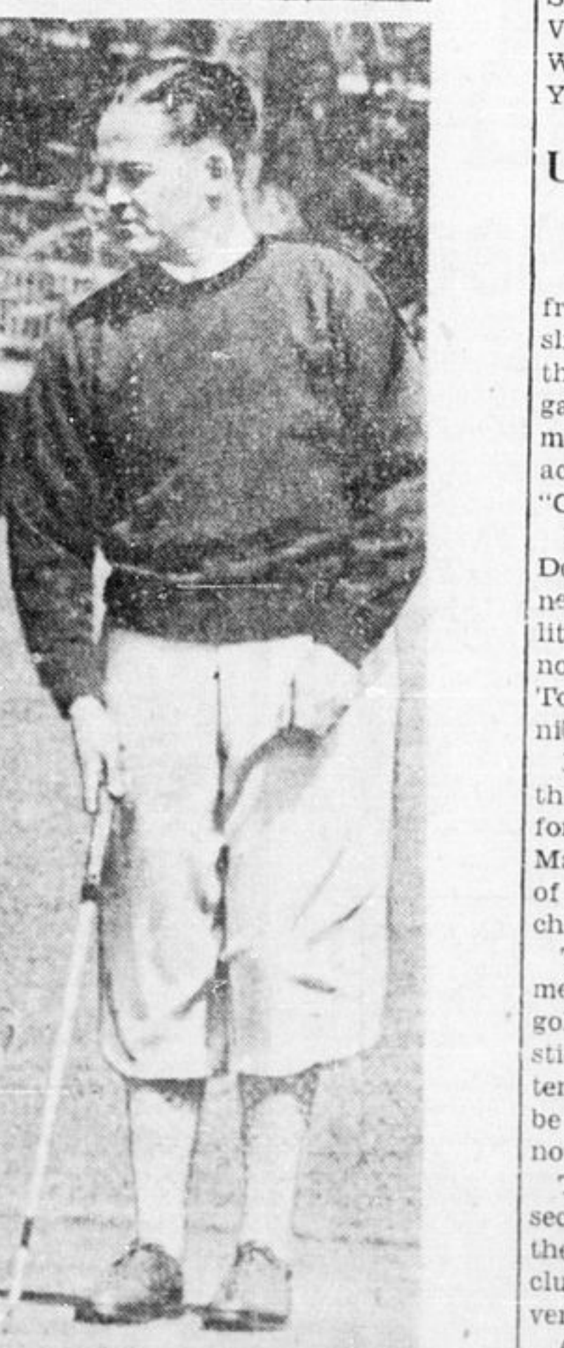
Bobby Jones, whose putter "Calamity Jane" has proved the deciding factor in many a tournament, watches Gene Sarazen putt the ball on the putting green at Jones' course in Atlanta, Georgia. They are preparing for the masters' tournament, which gets under way there shortly.