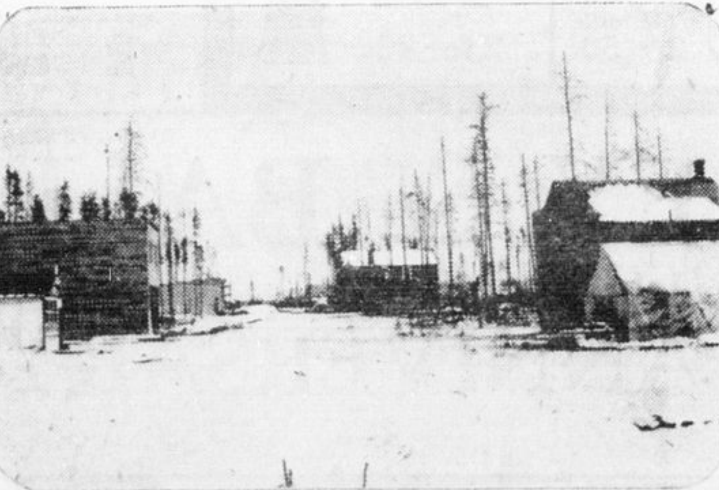
Site of the Moisley & Ball Drug Store twenty-five years ago. Contrasting the present modern city of Timmins with its up-to-date structures shows the growth and development of the community—a growth and development in which Moisley & Ball have taken their share in the past ten years.