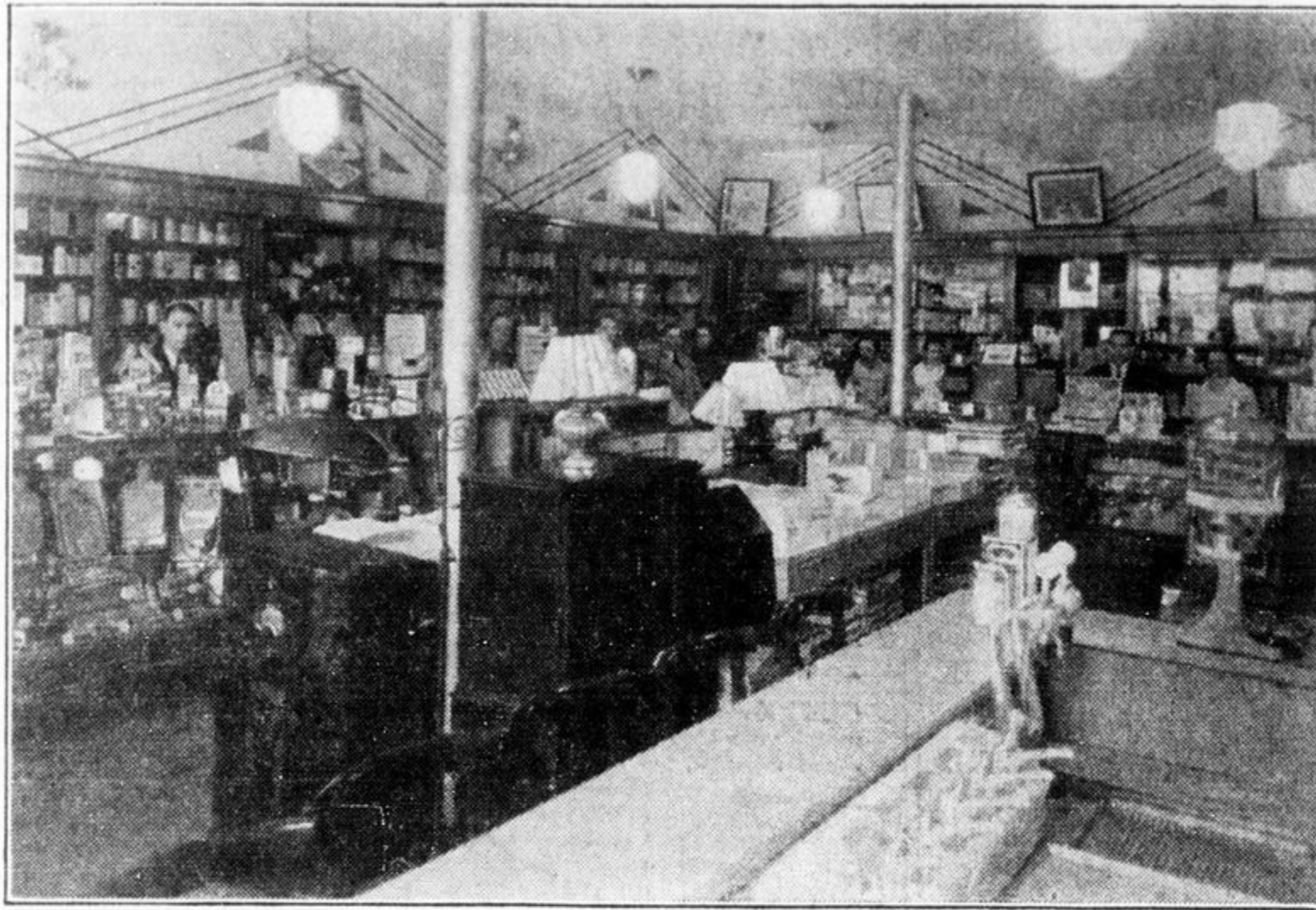
This view of the interior of Moisley & Ball's Drug Store shows the Soda Fountain at the right front and the other departments and staff of the store being shown ready for business and prepared for increased trade on the occasion of the tenth anniversary of the firm.