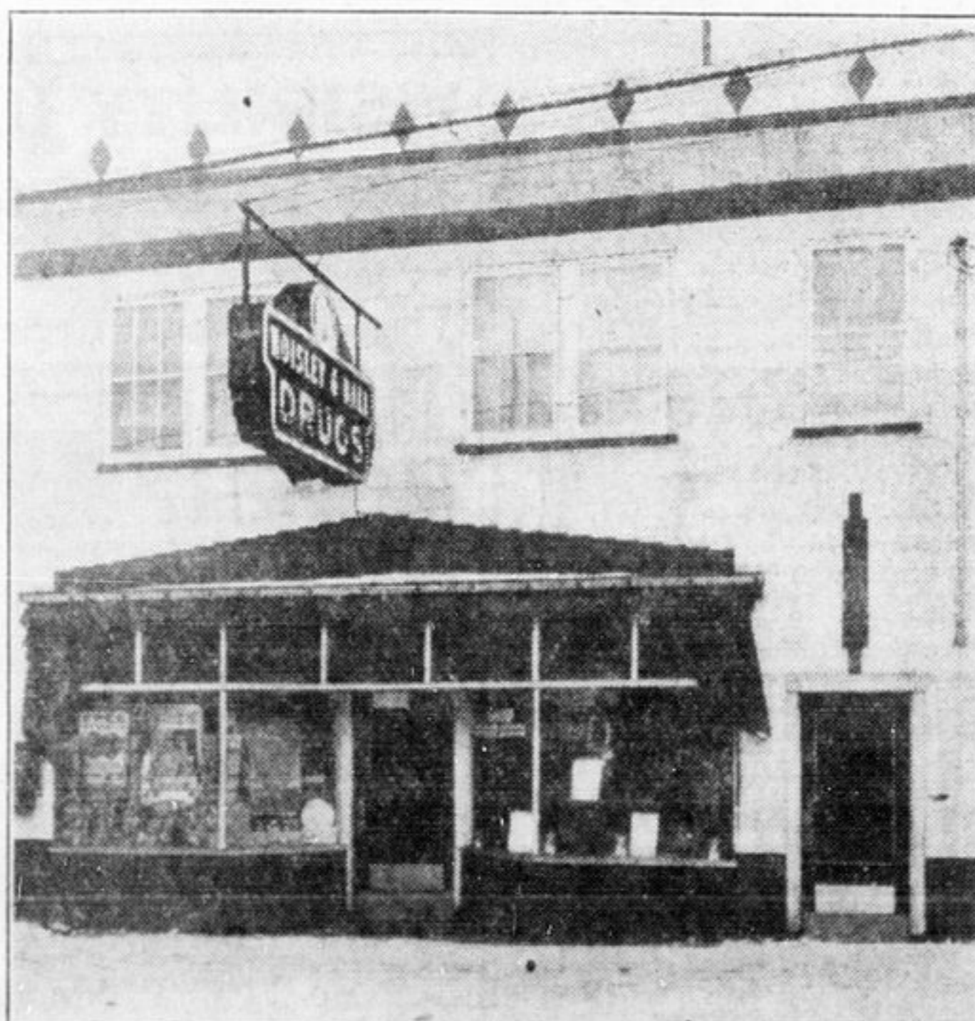
Moisley & Ball's Store, Timmins, shows one of the most modern fronts in the North Land. Attracting and inviting it is a foretaste of the service and quality within.