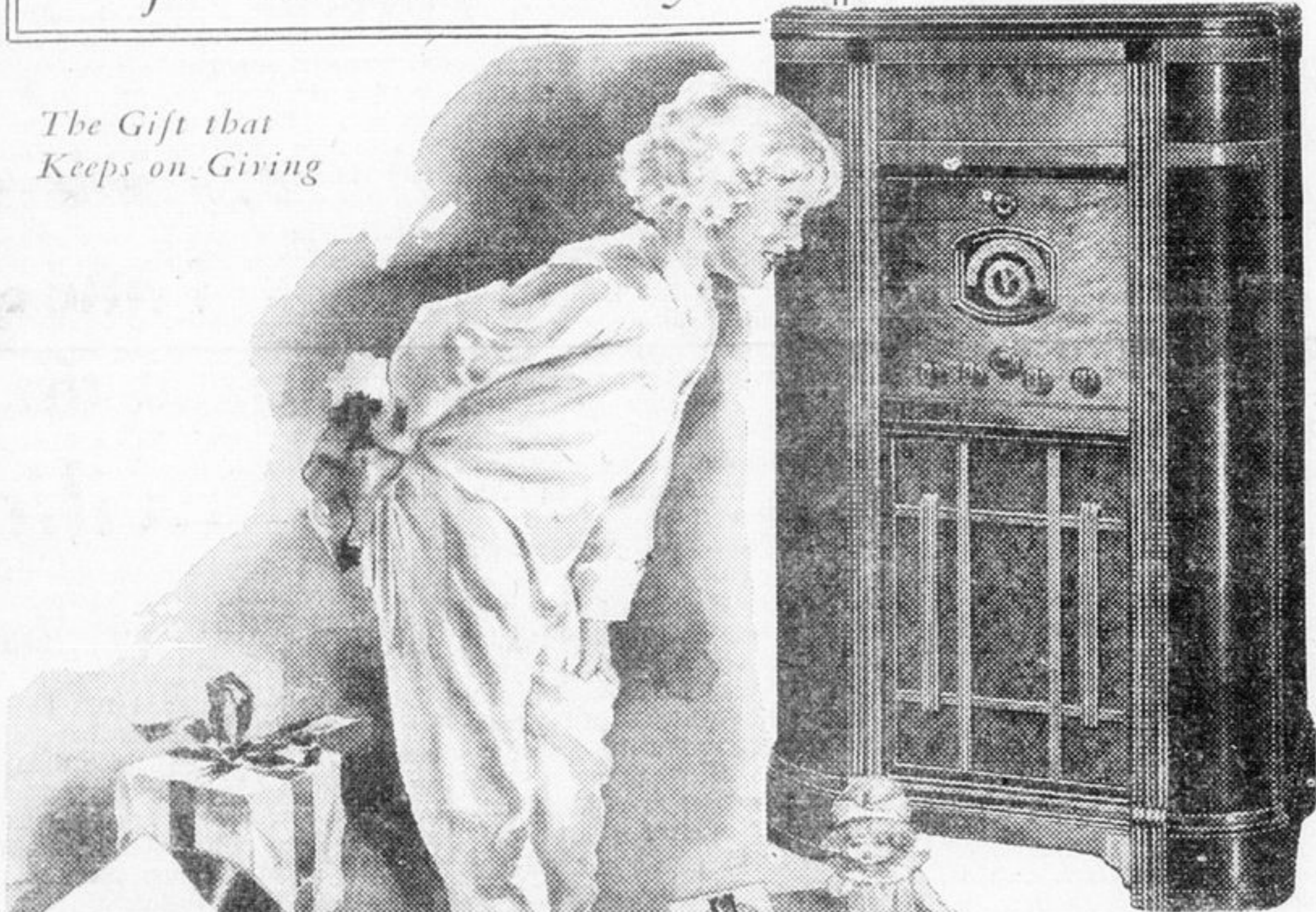
Radio-Phonograph Model D10-1

Here is complete entertainment. An instrument that adds the vast treasure trove of recorded music to the wonders of RCA Victor world-wide reception.