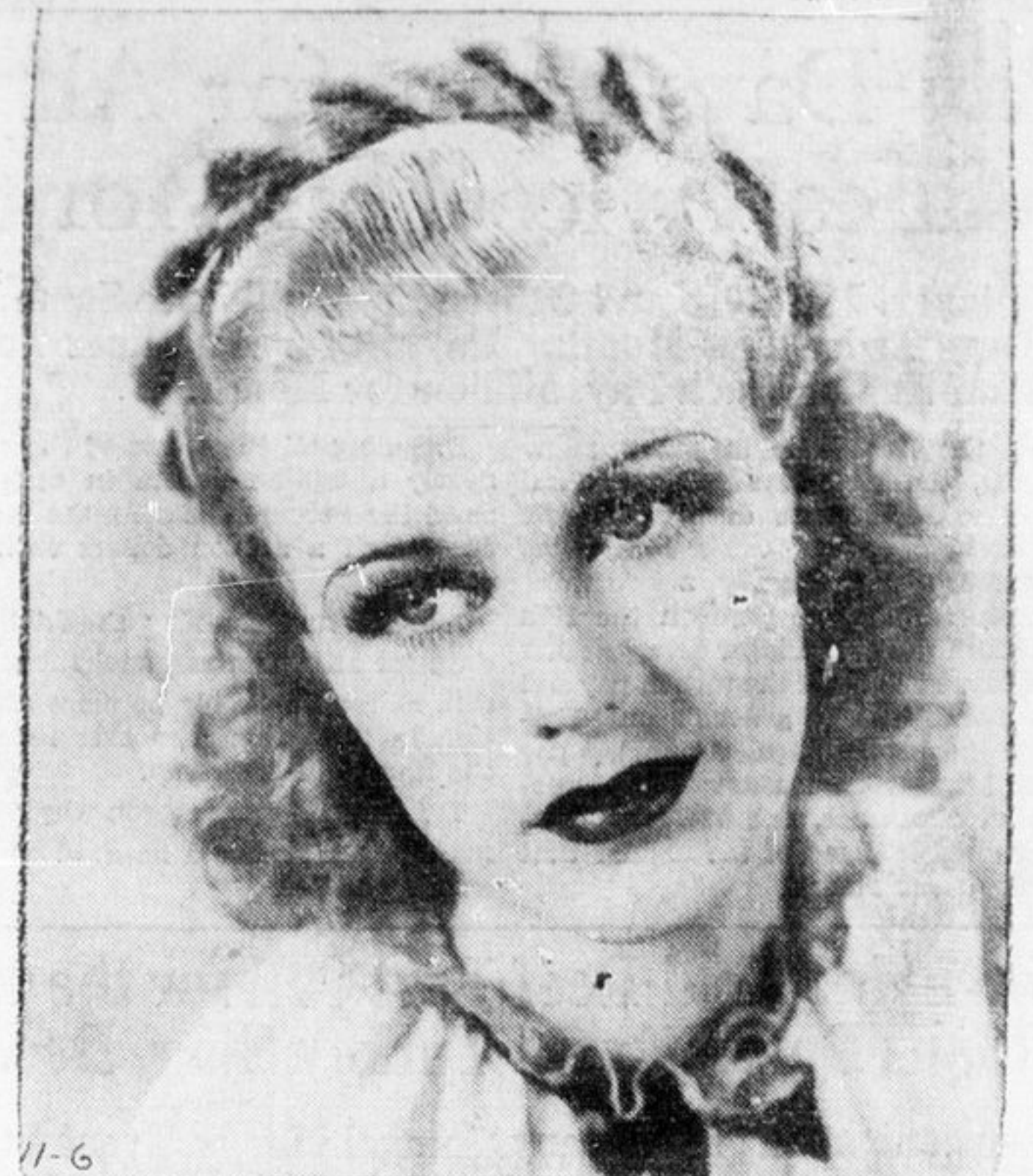
GINGER ROGERS invariably wears a braid on her golden hair to add a formal touch for evening. In this photograph she has adapted the new version of twisted strands instead of the usual braid.