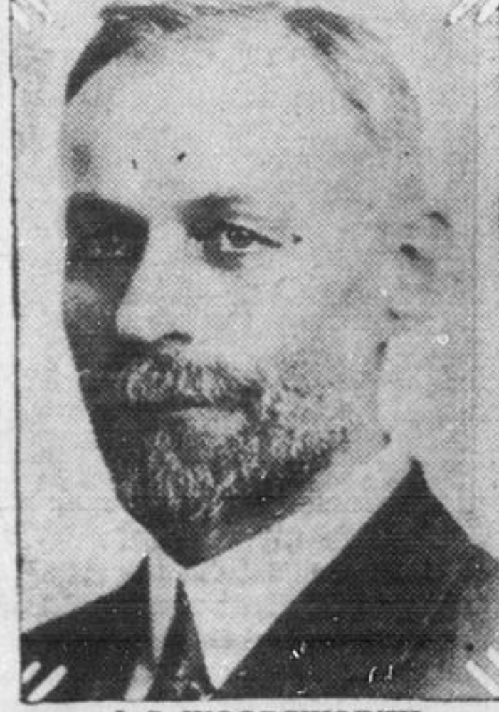
J. S. WOODSWORTH Leader of the C.F. Campaign in the Riding of Winnipeg North Centre.