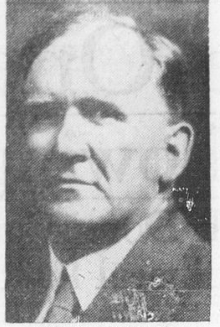
HON. W. A. GORDON Minister of Mines, Labour, Coloniza- tion and Immigration in the Ben- nett Government. Candidate in Temiskaming, Ont.