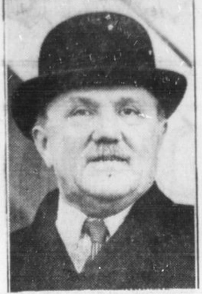
HON. ERNEST LAPOINTE Former Member of King Cabinet. Liberal Candidate for Quebec East.

PORTAGE LA PRAIRIE PROVENCHER ST. BONIFACE SELKIRK SOCRIS SPRINGFIELD