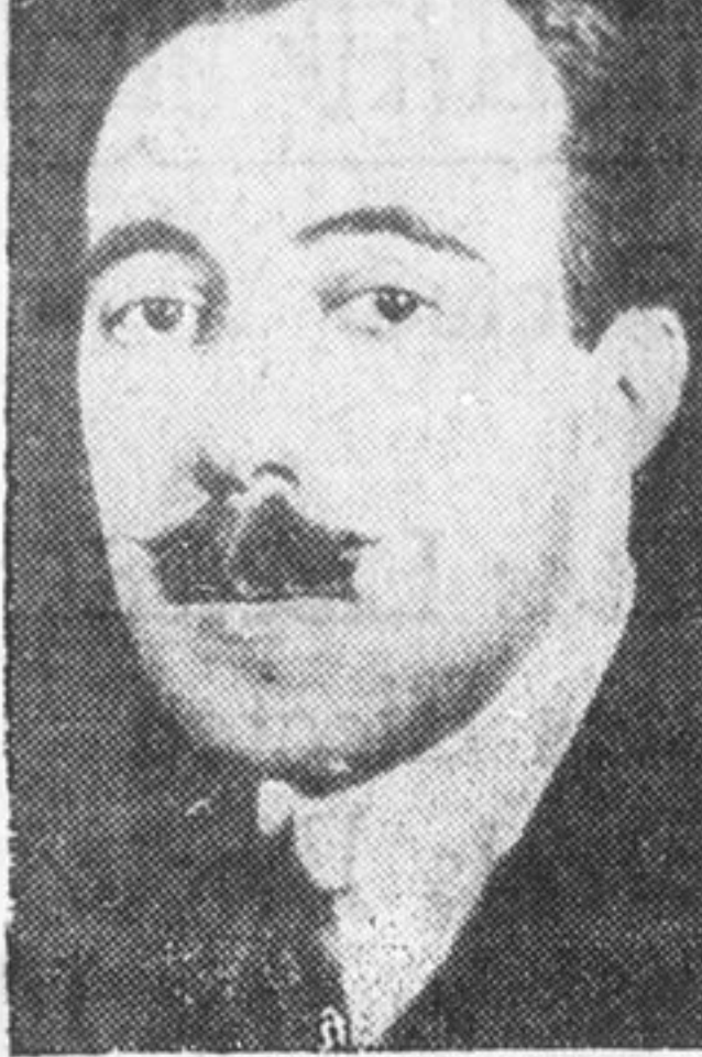
HON. MAURICE DUPRE Solicitor General in the Bennett Cabinet. Conservative Candidate for Quebec West.