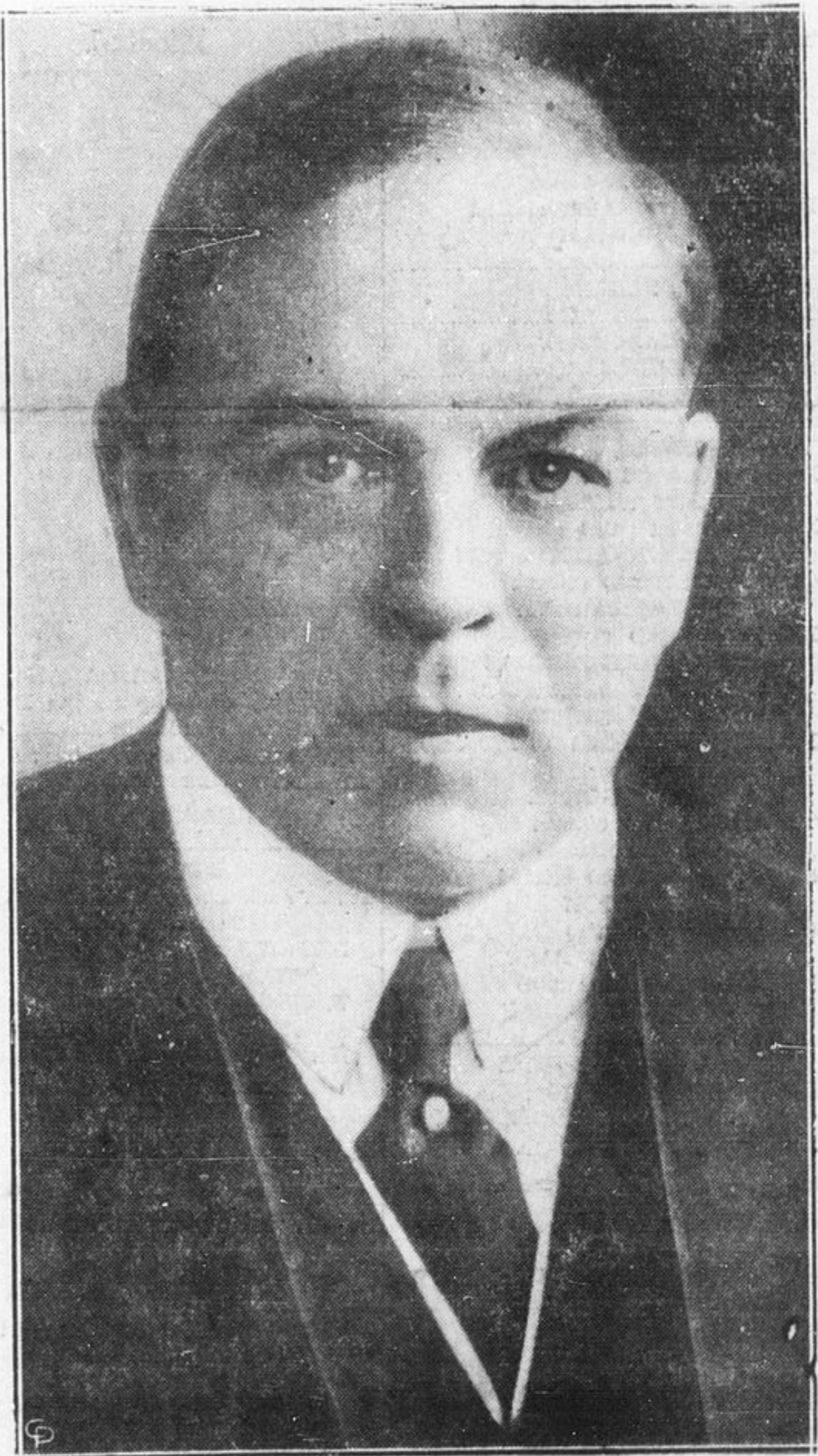
Hon. W. L. Mackenzie King who made a sweeping victory with his party, and will be the new Premier.