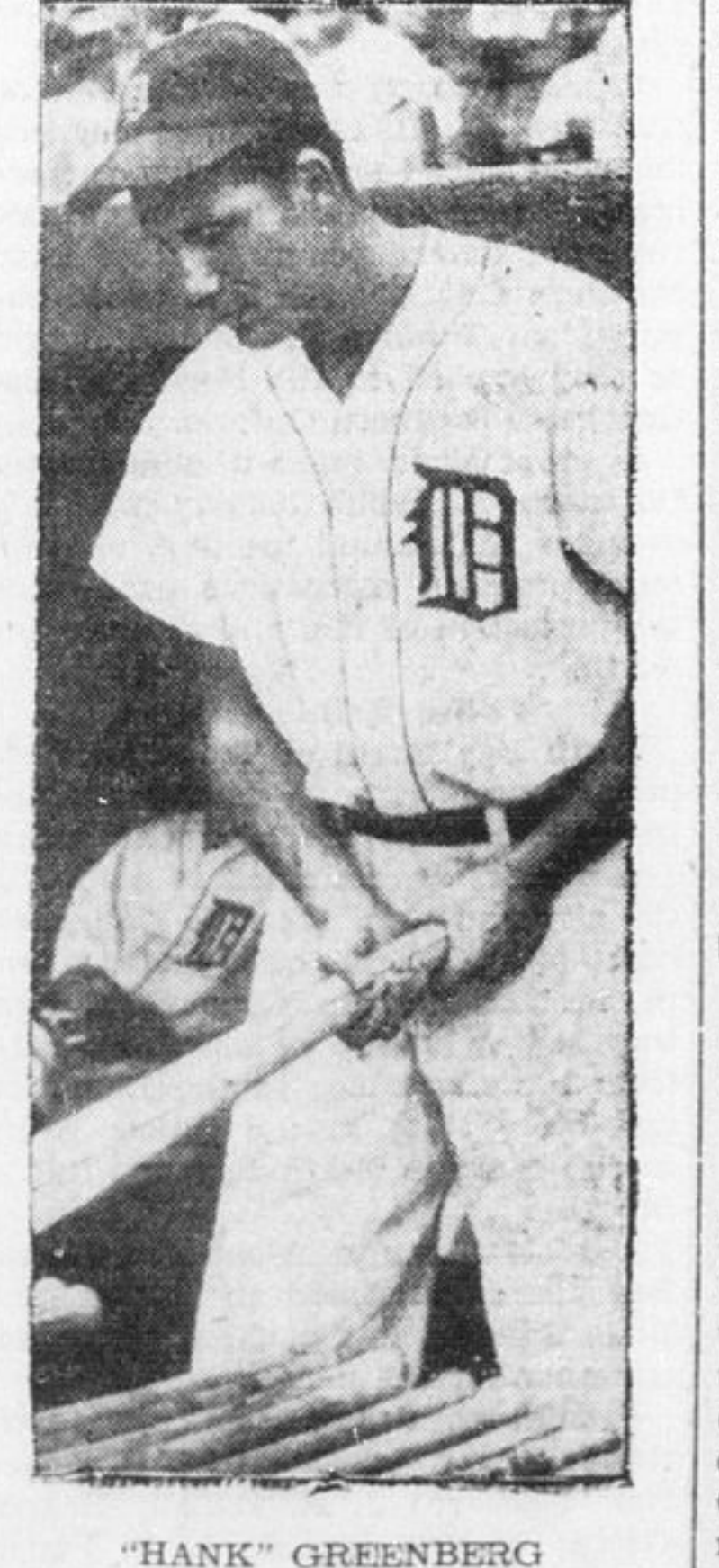
"HANK" GREENBERG Henry "Hank" Greenberg, slugging first baseman for Detroit Tigers, looks over a huge war club, presented to him at Navin Field, Detroit, by northern Michigan admirers. But Greenberg has belted out a sizeable list of home runs without the aid of the over-sized willow.