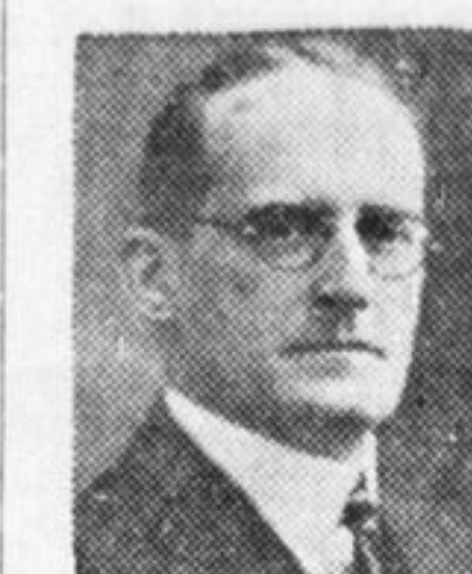
That Body of Yours

The syndicate has been financed in Timmins, and now holds six patented claims. Mining men representing important interests are expected in at the property this week to do sampling.