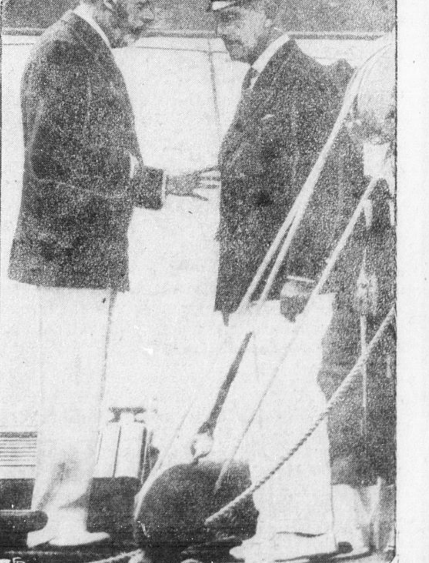
Two of England's most prominent sailors are shown on board the King of England's yacht, the Britannia, at the annual Royal Southampton Yacht club regatta at Cowes, England. At the LEFT is the Britannia skipper, King George, and at RIGHT is Lord Jellicoe—Jellicoe of Jutland—the fighting admiral of the world war, who is now retired. This picture was made before the Britannia competed in one of the events—and finished last—a very poor last.