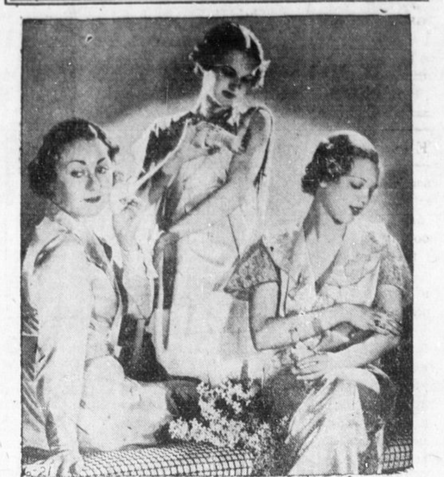
The latest perfume theory, it would seem, is that perfume should be applied, not to clothes, but all over the skin in the continental manner. (Posed for Pinaud by Albertina Rasch dancers.)