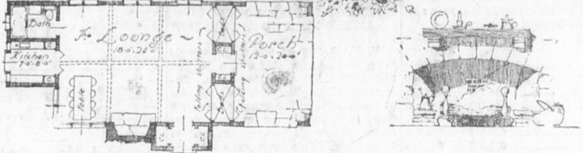
This is a picture of the house referred to in the adjoining column. It is an inexpensive type of house and yet one that will provide lots of comfort. The details given in the article are not necessarily to be followed religiously but changes may be made to suit the individual needs and tastes. In fact, as noted before, the descriptions and illustrations published on this page are meant to be suggestive rather than imperative.