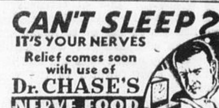
Dr. CHASE'S NERVE FOOD

Poise and Posture Perfect posture and beauty are an inseparable combination. In the matter of posture that little word pops up again. The whole secret of graceful, beautiful carriage is "up." Stand up.