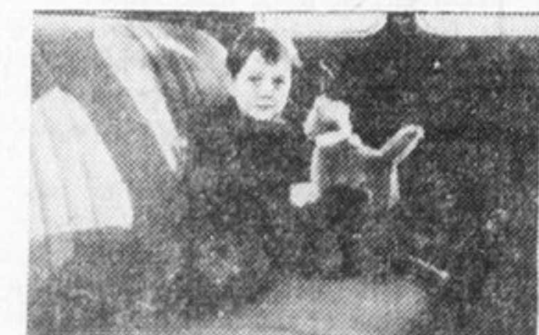
The extra safety of the Ford V-8 is vital to all — it is doubly important where there are children. The Ford has always been a leader in safety. Ford pioneered in the use of the all-steel body with Safety Glass in a low-price car.

Other safety factors of the V-8 are the bigger brakes, tip-toe clutch and brake operation, finger-tip ease of steering and the larger 30-pound pressure tires with wider tread. The wider transverse springs increase stability—reduce "sway" on fast turns. Have a demonstration soon of Ford V-8 safety. See how it balances V-8 performance, economy and riding comfort.