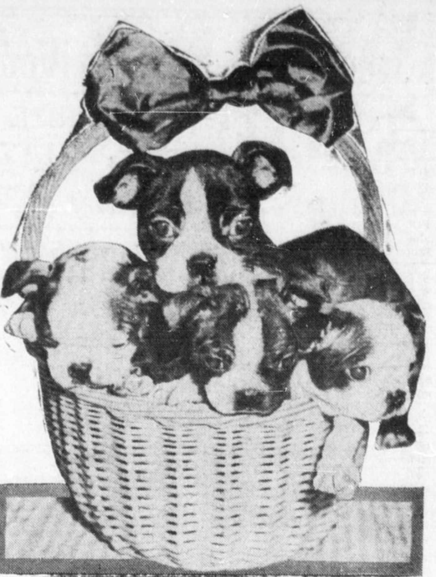
This basketful of bull terrier puppies cast appealing eyes around in search for new masters. They and other canines were auctioned in New York art gallery as Christmas presents for some lucky young children.