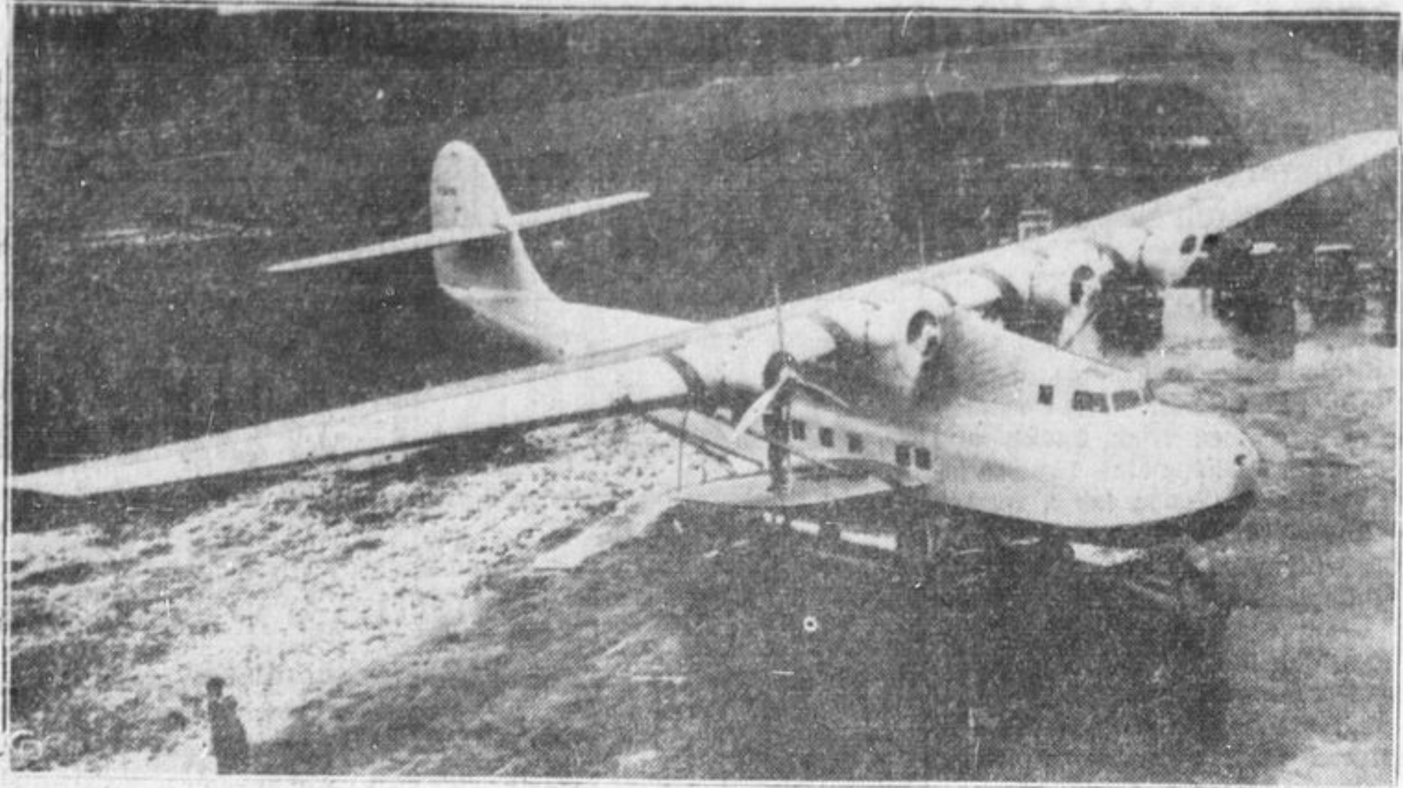
Secret of "World's Largest Liner" Made Public at Last

Its construction guarded with the greatest secrecy over a period of two years, the giant flying clipper No. 5 said to be the world's largest air liner, has at last been shown. It was revealed for the first time to a small group of aviation executives and experts at Baltimore, Md. No. 5 was built for trans-Pacific use by the Pan-American Airways. It is a gleaming giant of chrome metal, measuring 90 feet in length, and 24 feet high, and it has a wing span of 130 feet. It weighs 23,100 pounds, empty. It will take the air with its full crew, 50 passengers, and capacity load of freight, weighing 51,000 pounds.