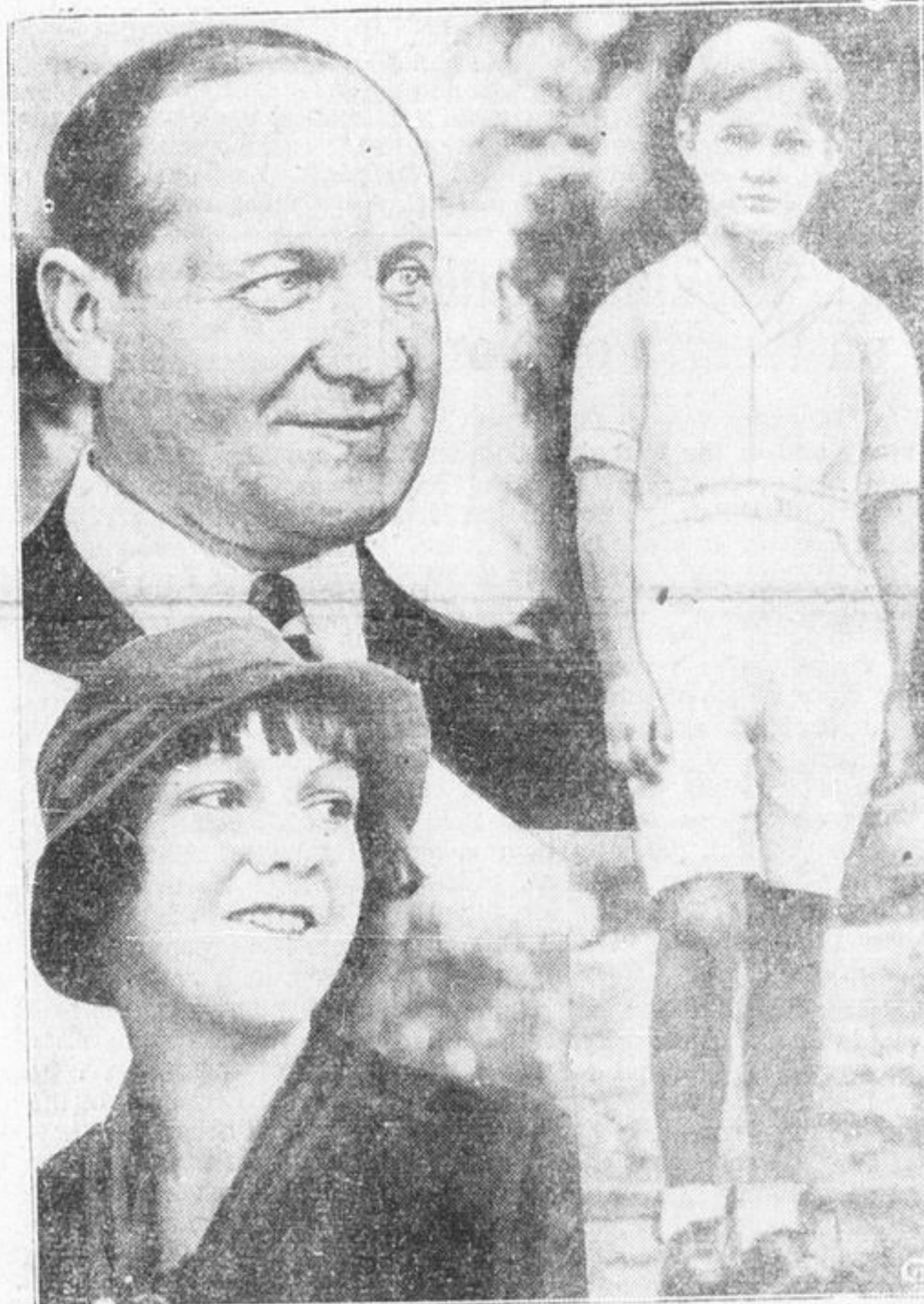
Leaves Mother; Goes to Grandma