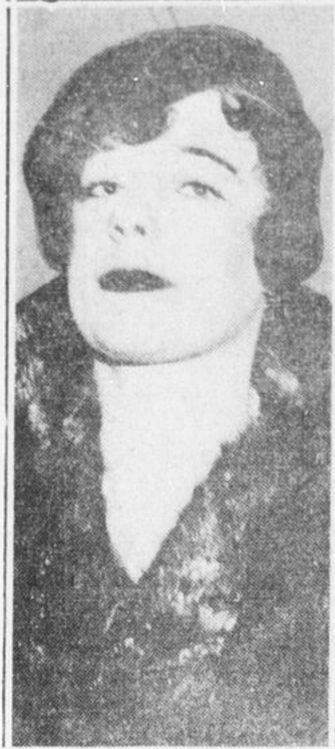
London's Richest Girl