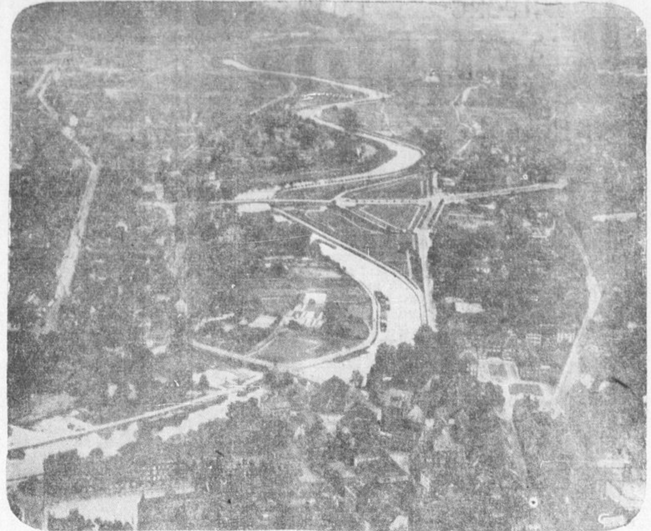
Air View of Centre of European War of Diplomacy

Despite the quietness of the European scene for a few days (that is comparatively) the Saar Valley still remains as the crucial centre of European diplomacy. With the plebiscite approaching (January 13) both Nazis and France are making efforts to assure that the vote will swing to their country, although observers concede the rich district to Germany if the vote is held. Pictured above is the residential district of Saarbrücken, largest and most important town in the valley. The Saar is noted for its coal and iron deposits.