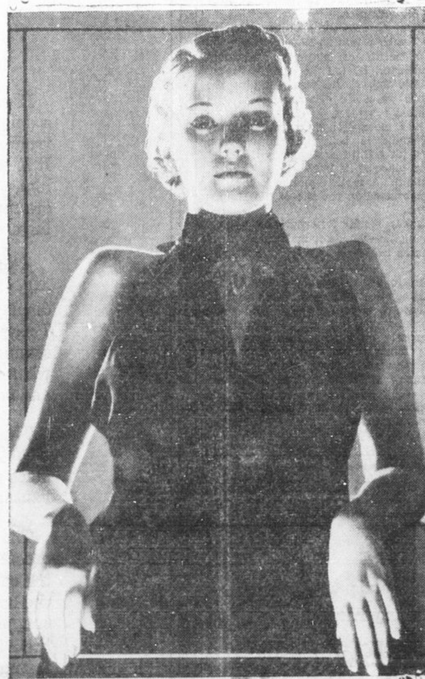
A CHARMING STUDY of light and shadow, with Phyllis Brooks, latest to make her entrance into filmland, as the lovely subject.