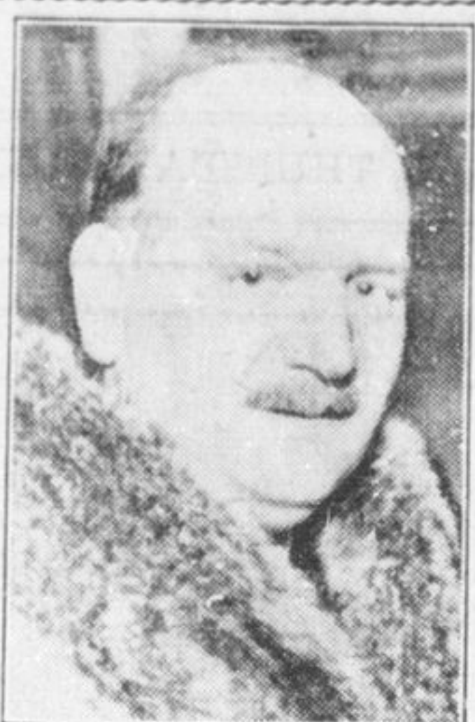
PIERRE ETIENNE FLANDIN

erstwhile Minister of Public Works, who succeeds "Papa" Doumergue as Prime Minister of France. Six-foot-six in height, the new Premier needed only 10 hours to put together the pieces of the Cabinet wrecked by Edouard Herriot's radical Socialists.