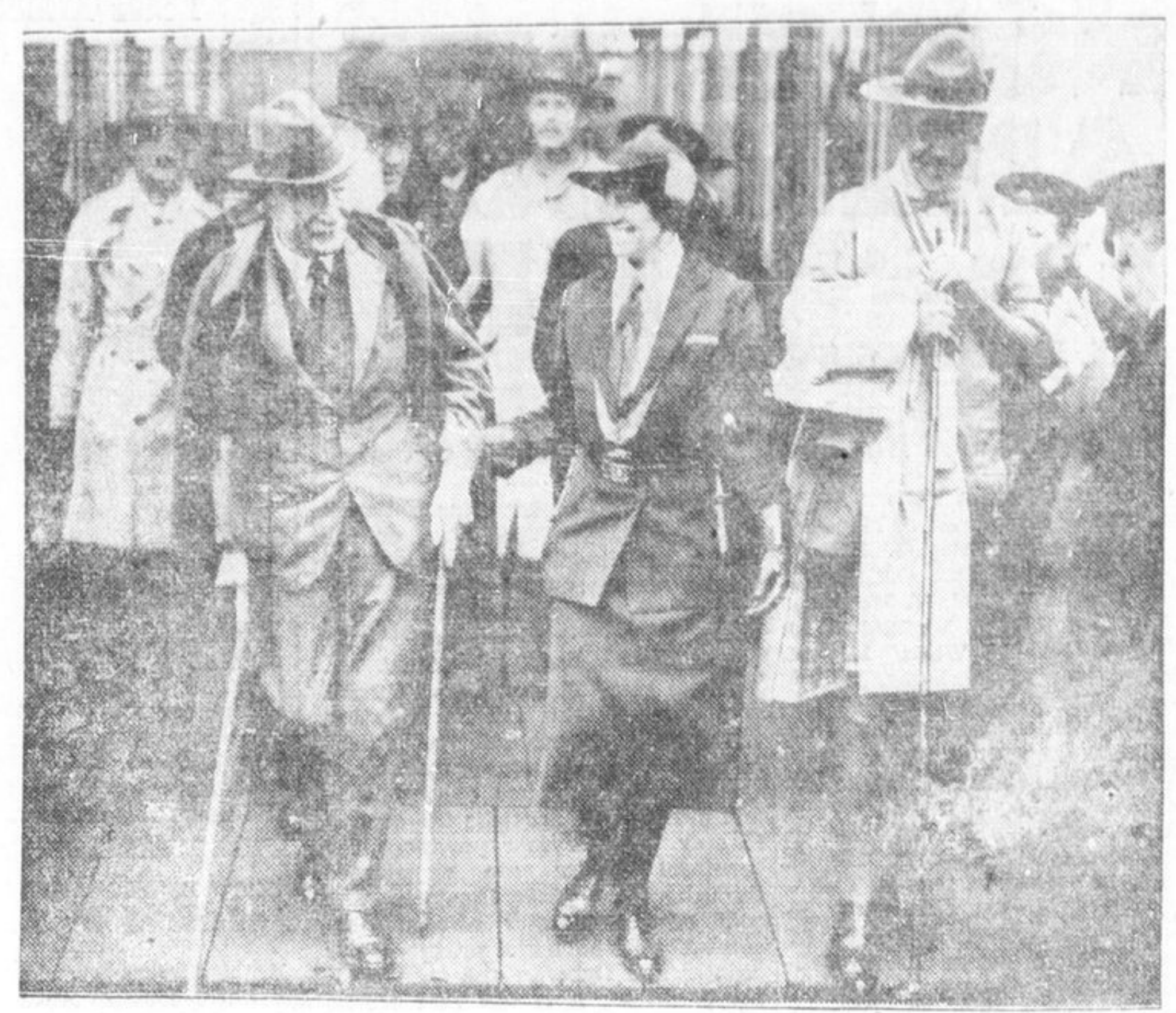
THE CHIEF SCOUT RETURNS HOME AFTER HEALTH TOUR Lord and Lady Baden-Powell are shown returning to England after a long cruise in the Mediterranean with 700 scouts and guides. Lord Baden-Powell who has been seriously ill, is shown being assisted by Lady Baden-Powell. The Chief Scout is to visit Canada next year if his health permits.

No. 52, passenger, daily, leave Timmins 1.00 p.m., arrive Porquus Jct. 2.15 p.m. Returning, No. 53, passenger, daily