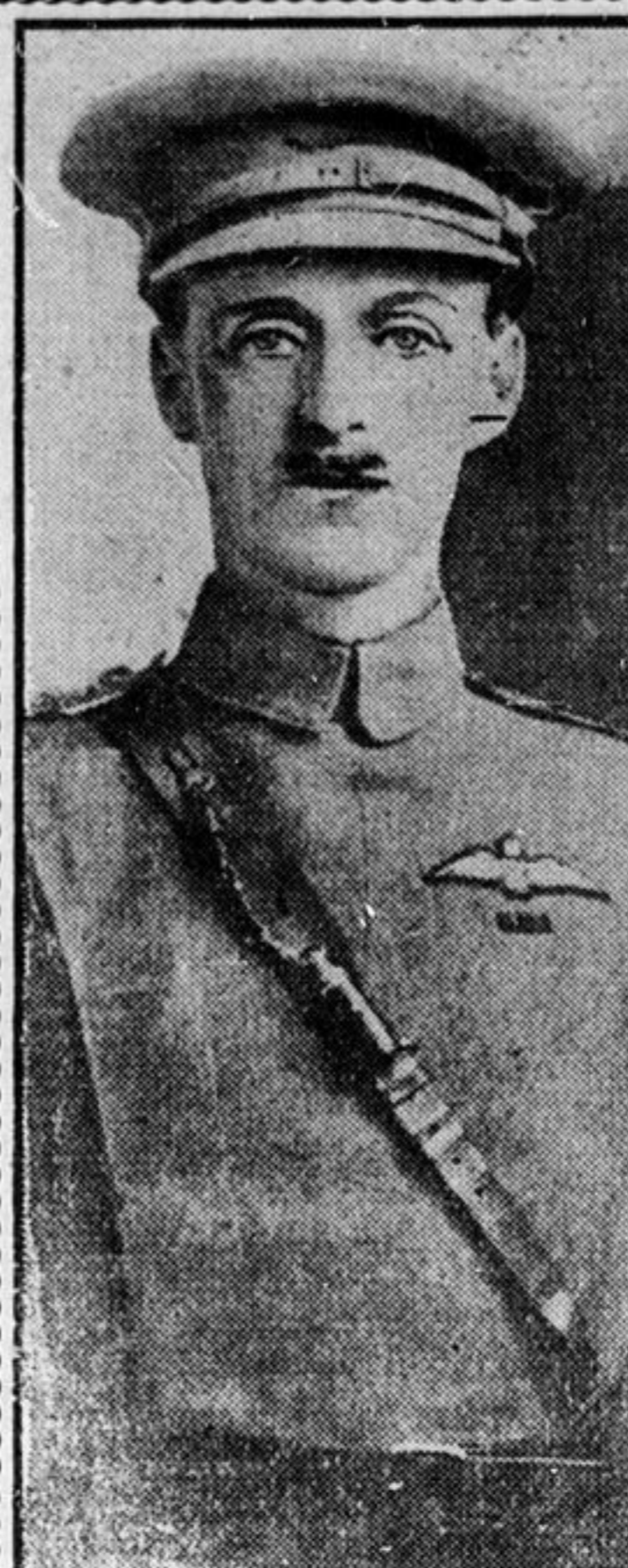
DELAYS TRIP OWING TO GANDHI