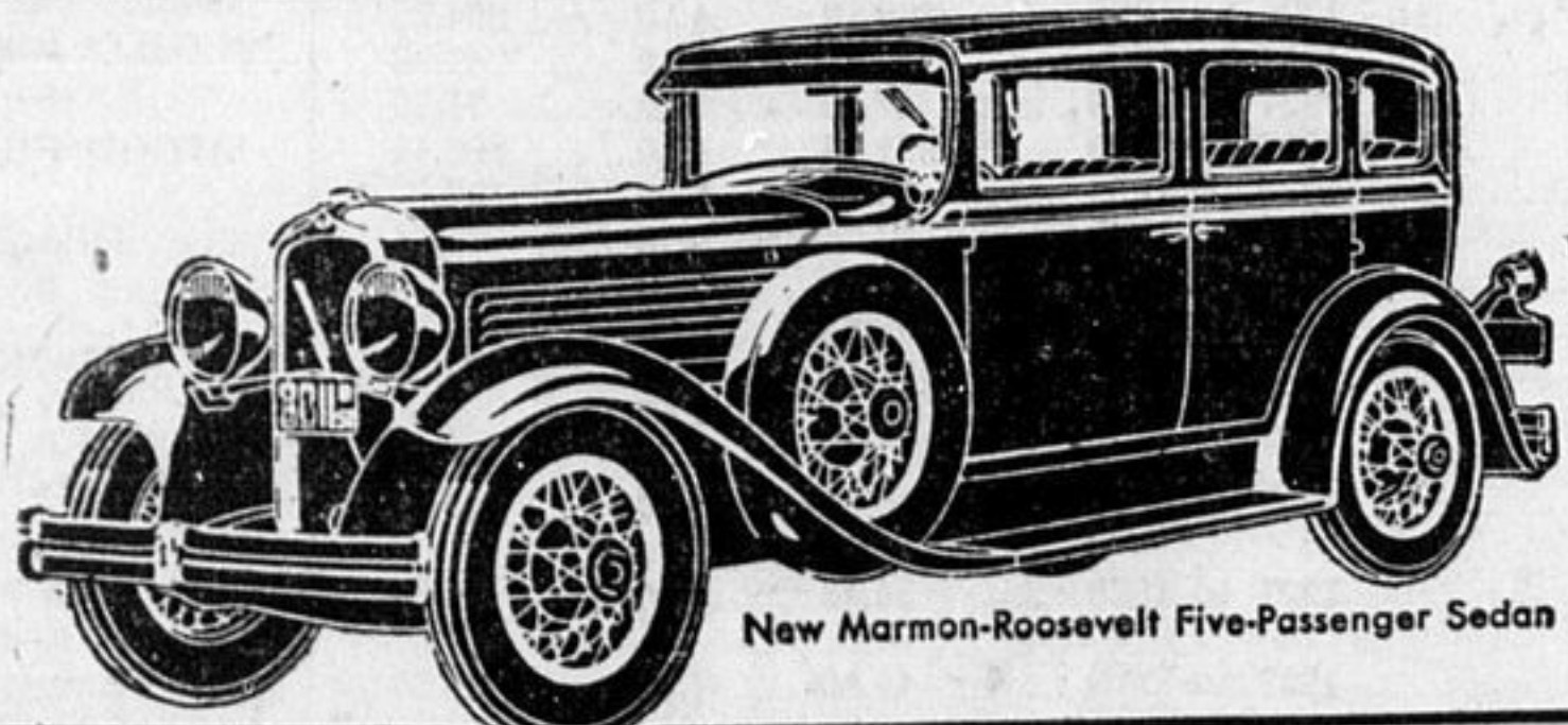
New Marmon-Roosevelt Five-Passenger Sedan

The new edition of CANADA'S first straight-eight in the $1500 field— with massive Marmon radiator—greatly increased power—lower, more impressive appearance and luxurious new fittings . . . the only time-proved eight-cylinder car in its price field.