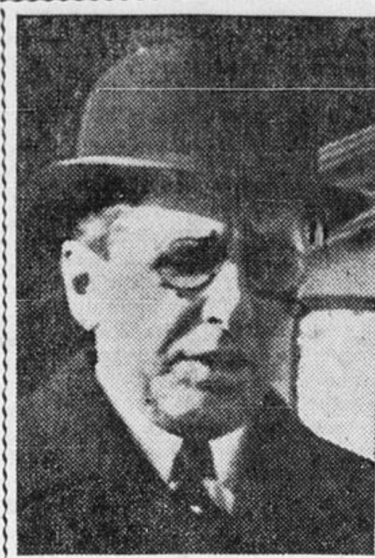
CREATED KNIGHT OF BATH Viscount Lee of Fareham, former Conservative Cabinet Minister and soldier, who organized the military survey of the Canadian frontier in 1894-96, who has been honoured by King George with a Knighthood, Grand Cross of the Order of the Bath. This award was conferred in His Majesty's birthday list.