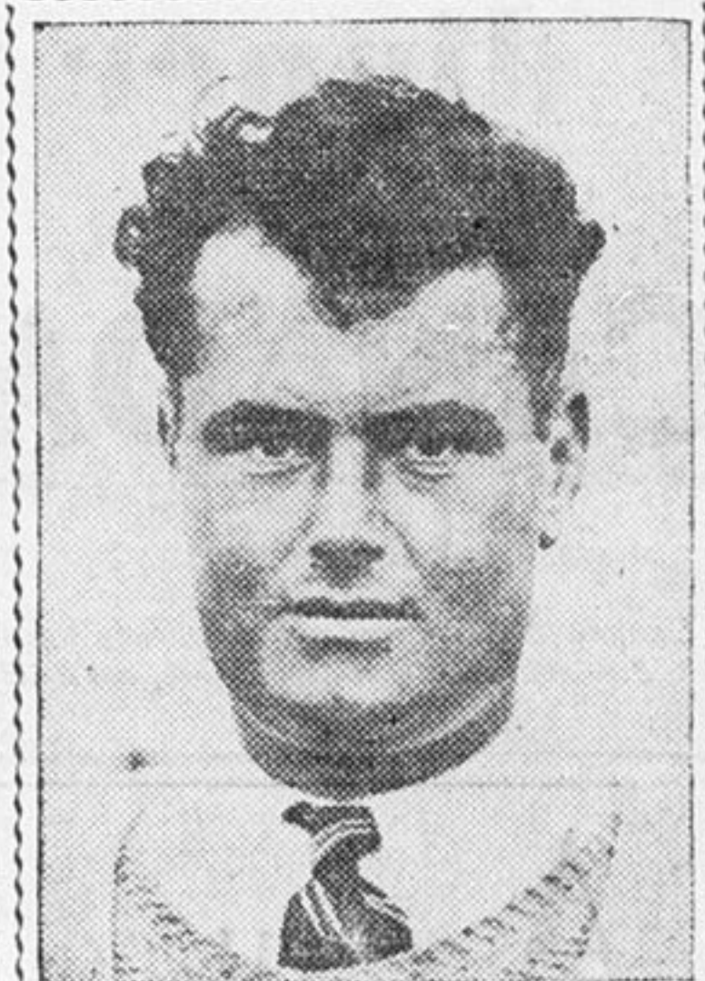
PLAYS GOOD GOLF Cyril Tolley, famous British amateur golfer, who has reached the fourth round of the British amateur golf championship.

It is to be hoped that the objectionable practice complained of will be stopped at once. Unless the interference with the rights of the youngsters is stopped, there will no doubt be further steps taken to prevent the objectionable use of the place fitted up for the use of the children for bathing.