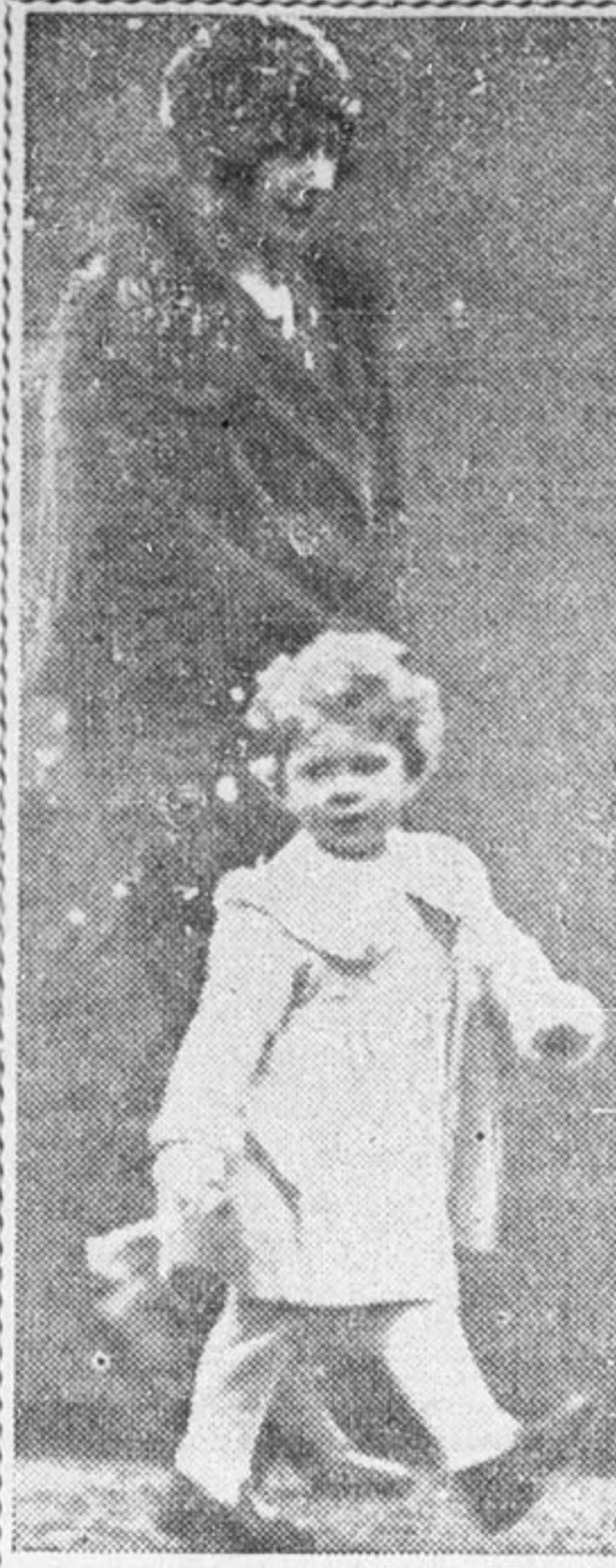
THE DELIGHT OF THE KING Little Princess Elizabeth, daughter of the Duke and Duchess of York, is here seen taking a morning walk with her mother in the grounds of their London home, Piccadilly. During the King's illness the happy little Princess has been a ray of sunshine in the royal palace.

Toronto Mail and Empire:—A selling market can be just as exciting as a buying market and outspeed the ticker just as decisively, but it has quite a different atmosphere. In one case there is a feeling in the air as of schoolboys off for the holidays, while the other suggests a return to prison.