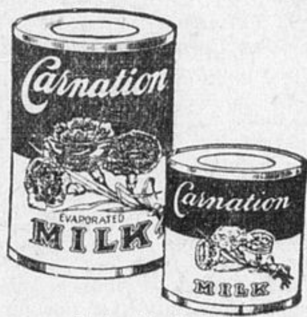
Produced in Canada

CARNATION is ideal for summer use. Keeps sweet without ice—no waste. Adds food value to light summer dishes. Gives extra smoothness and flavor to salad dressings, desserts, ices. Just pure whole milk evaporated to double richness, kept safe by sterilization. Write for free Cook Book Carnation Milk Products Co. Limited Aylmer, Ontario