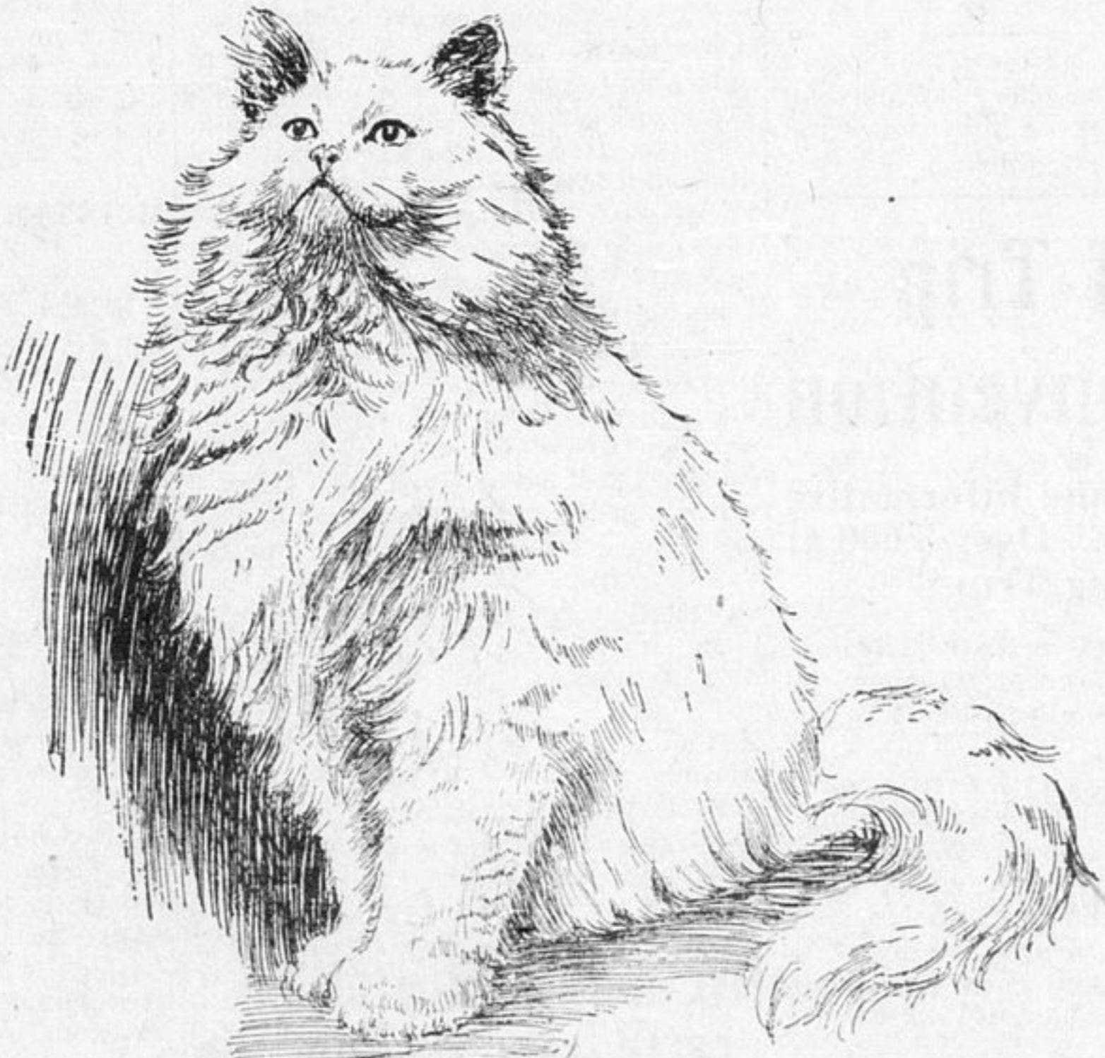
The sleek complacent cat purr-rs out her tune of drowsy happiness; a soothing song of feline satisfaction. Contentment is her theme, the rhythmic ripple of her throat the measure.