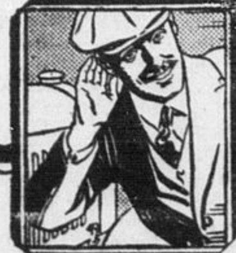
Hear that Motor "H-u-m-m"