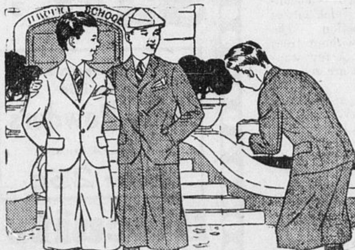
Sweeping Clearance of Men's and Boys' Suits