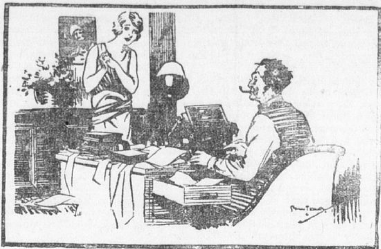
Journalist (interrupted by chatterbox wife): "Darling, I wish you'd remember that it is I who am paid so much per thousand words." —Passing Show, London