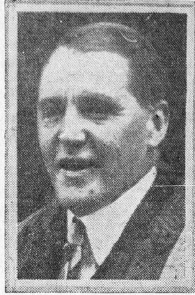
WHO WILL BE BRITAIN'S LORD CHANCELLOR? Viscount Cave (centre), Lord Chancellor of Great Britain, is expected to resign at any moment because of his advanced age and ill-health, and the names of the Right Hon. Sir Douglas Hogg, K.C. (left) Attorney-General, and the Earl of Birkenhead (right), Secretary of State for India, are mentioned as likely to succeed him