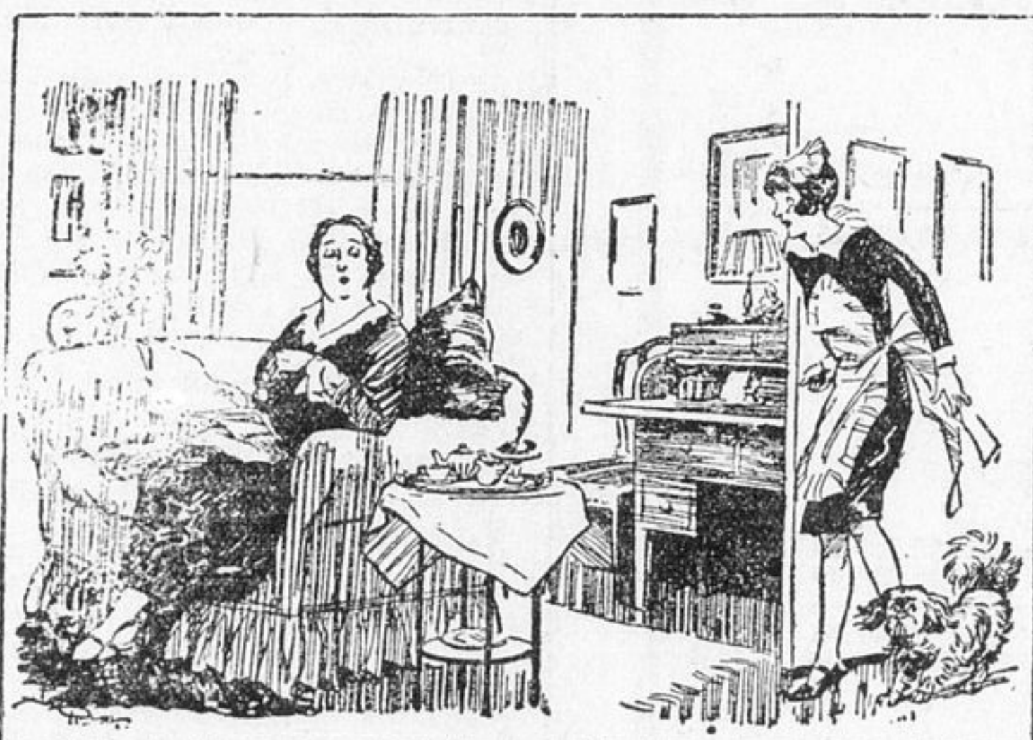
MAID: "There's a policeman downstairs, ma'am, says the dog bit him." MISTRESS: "Tell him we're sending it to bed without any supper."