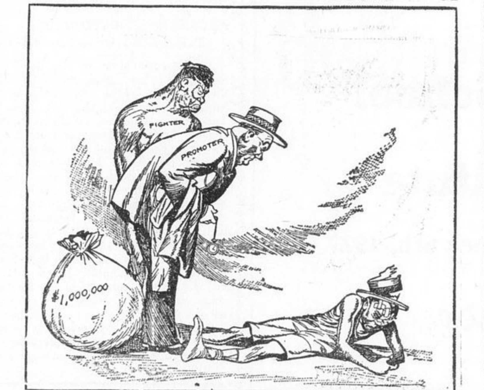
THE BIG QUESTION—CAN THE FIGHT FAN COME BACK?