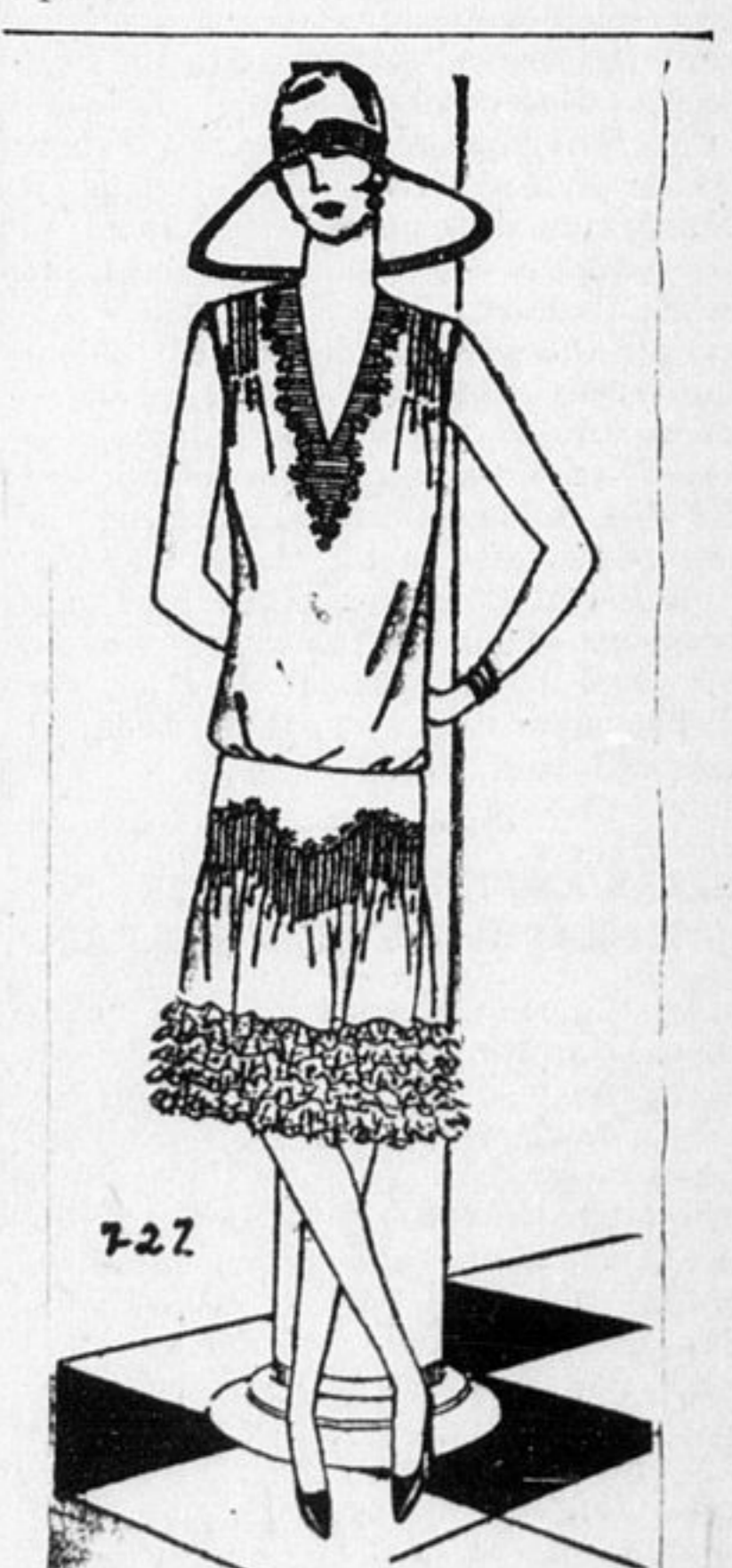
A Delightful Afternoon Frock of Voile.

The next regular meeting of the town council is scheduled for Monday afternoon, Aug. 22nd, commencing at 4 p.m.