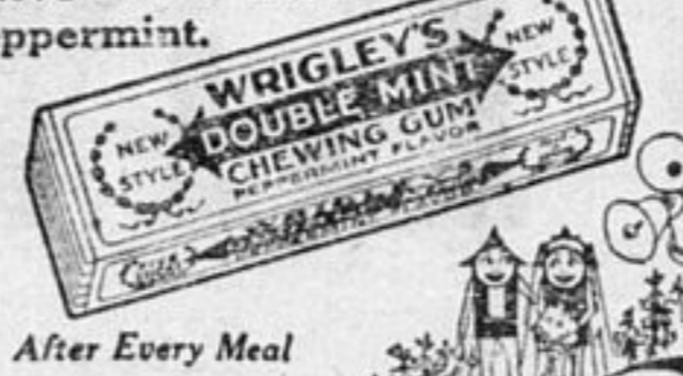
After Every Meal

We wouldn't say that Wrigley's has a place at the wedding ceremony, but in times of stress or when you have a trying ordeal to face—use Wrigley's new DOUBLE MINT—it's real Peppermint.