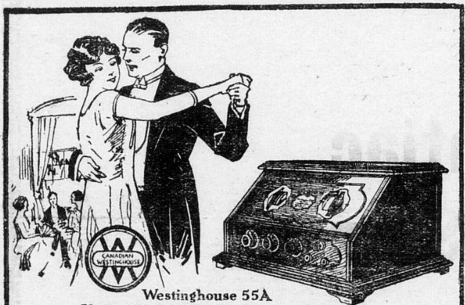
Westinghouse 55A Unequaled for long range, volume, tone and selectivity.