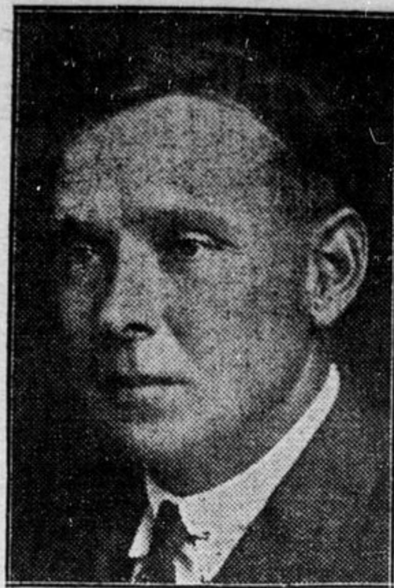
ALBERTA'S SURPLUS DOWN