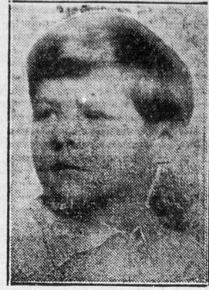
HEIR TO ROUMANIAN THRONE

Prince Mihail, son of Prince Carol of Roumania, and grandson of King Ferdinand and Queen Marie. There is a rumour that King Ferdinand, who is at present undergoing radium treatment for internal trouble will abdicate in favour of Prince Carol.