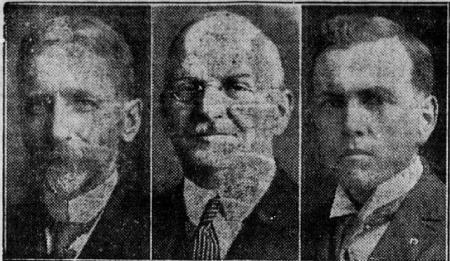
Leaders in Ontario Election Battle