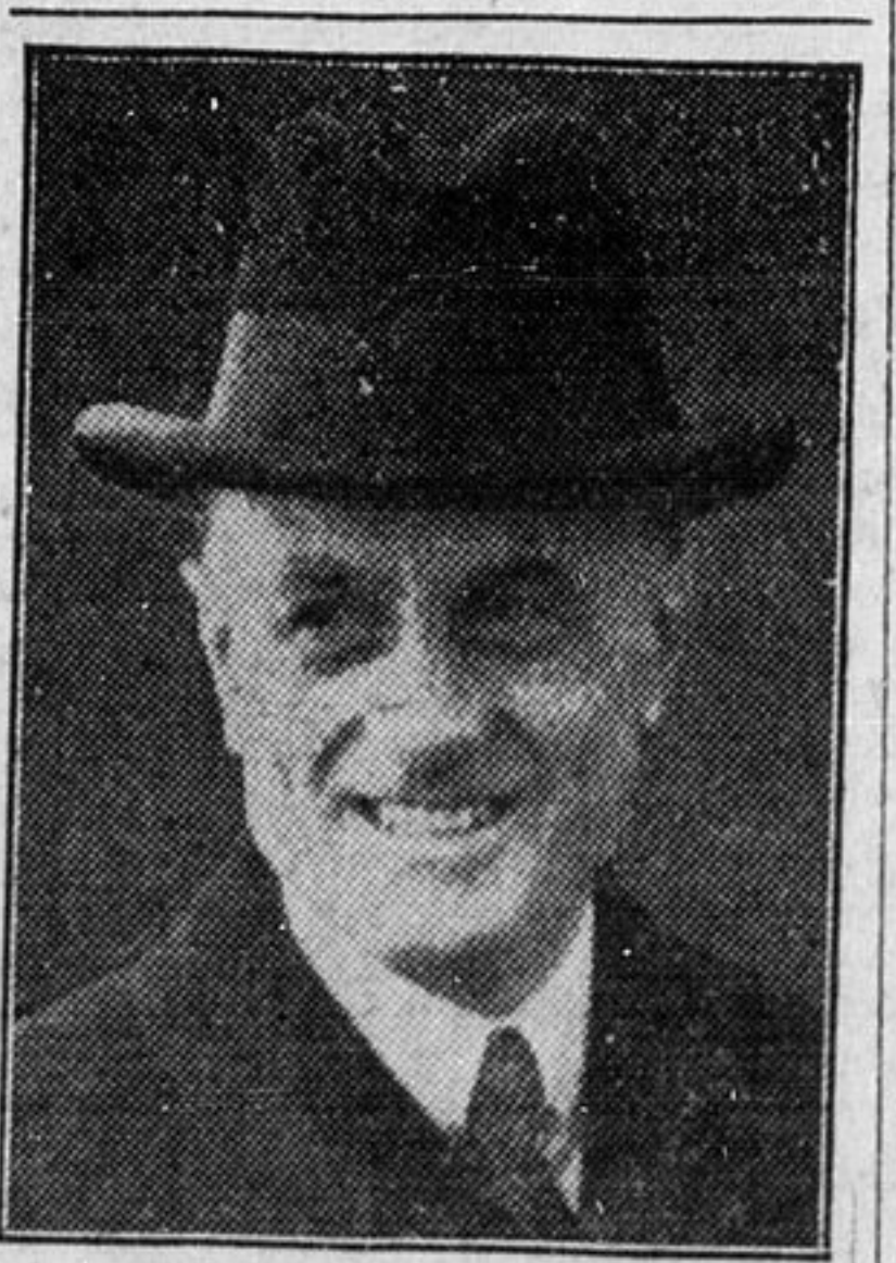
WOULD LINK EMPIRE BY AIR Sir Samuel Hoare, British Air Minister, outlined a proposal to the Imperial Conference for linking the various units of the Empire together by aeroplane and airship lines. Canada would be placed within 2 1/2 days of London by this means.