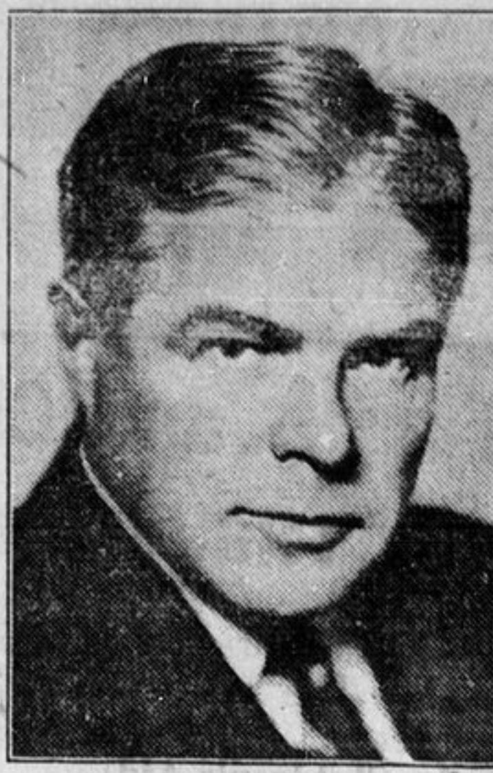
MR. E. W. BEATTY Latest photograph of E. W. Beatty, chairman and president of the Canadian Pacific Railway.