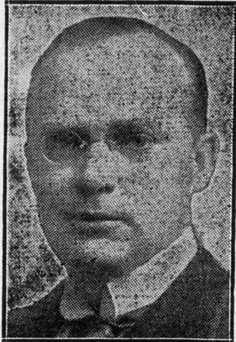
HON. R. B. BENNETT

Tenders to be handed to the Secretary of the Timmins High School Board, 26 1/2 Fourth Avenue, not later than Sept. 23rd, 1926. The lowest tender not necessarily accepted. -36-37