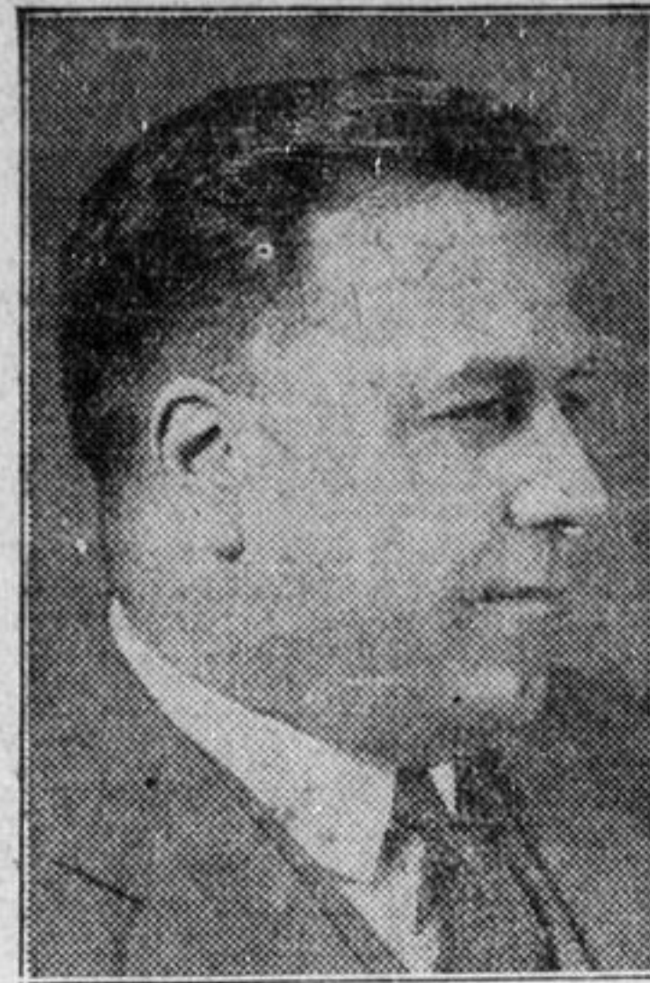
HON. RAYMOND D. MORAND M.D.