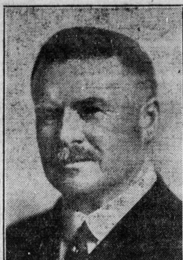
HON. S. F. TOLMIE