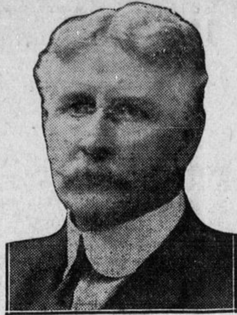
HON. J. D. CHAPLIN