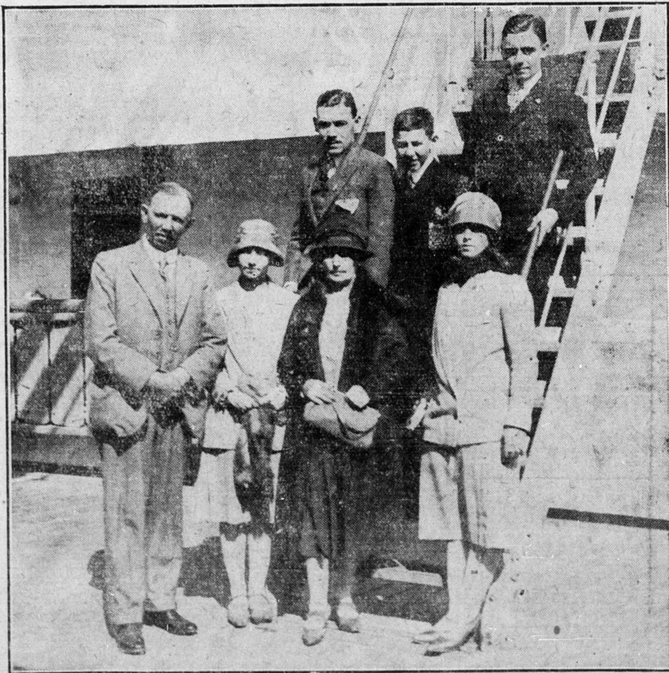
The Rt. Hon. J. H. Thomas, P.C., M.P. (left), photographed with his wife and family just before they sailed back to England on the Cunard liner Ausonia from the port of Montreal. Mr. Thomas is general secretary of the National Union of Railwaymen in Britain and was Secretary of State for the Colonies in the British Labor Government. The Thomas family arrived on the Cunarder Antonia and have spent three weeks touring the Dominion, accompanied by one of their sons, who is a resident of Montreal. The party were enthusiastic over their impressions of Canada and the reception they enjoyed everywhere.