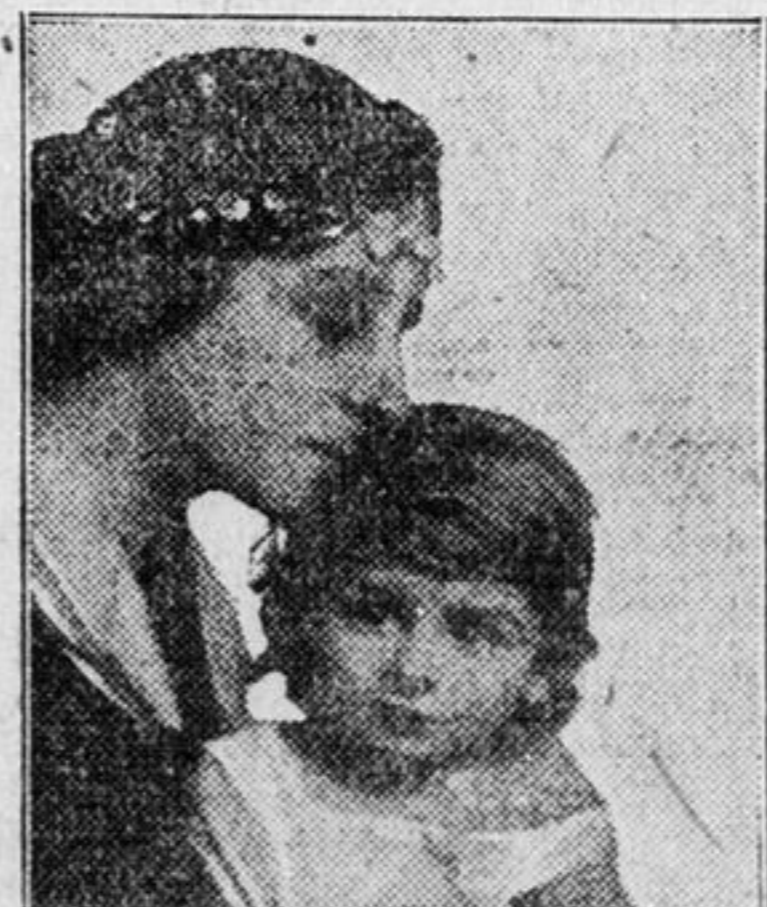
BRINGS SUIT AGAINST CAROL Zizi Lambrino, whose marriage to Crown Prince Carol of Roumania was annulled in order that he might marry Princess Helen of Greece. Now that he has renounced his title Zizi is suing him as the dynastic reasons no longer justify the annulment. With her is her little son.

The Haileyburian is running its usual guessing competition with the prize of a year's subscription to the person giving the nearest correct date for the going out of the ice from Lake Temiskaming. April 19th was the earliest date for the going out of the ice, this being in 1910. The latest was May 21st, this being in 1923.