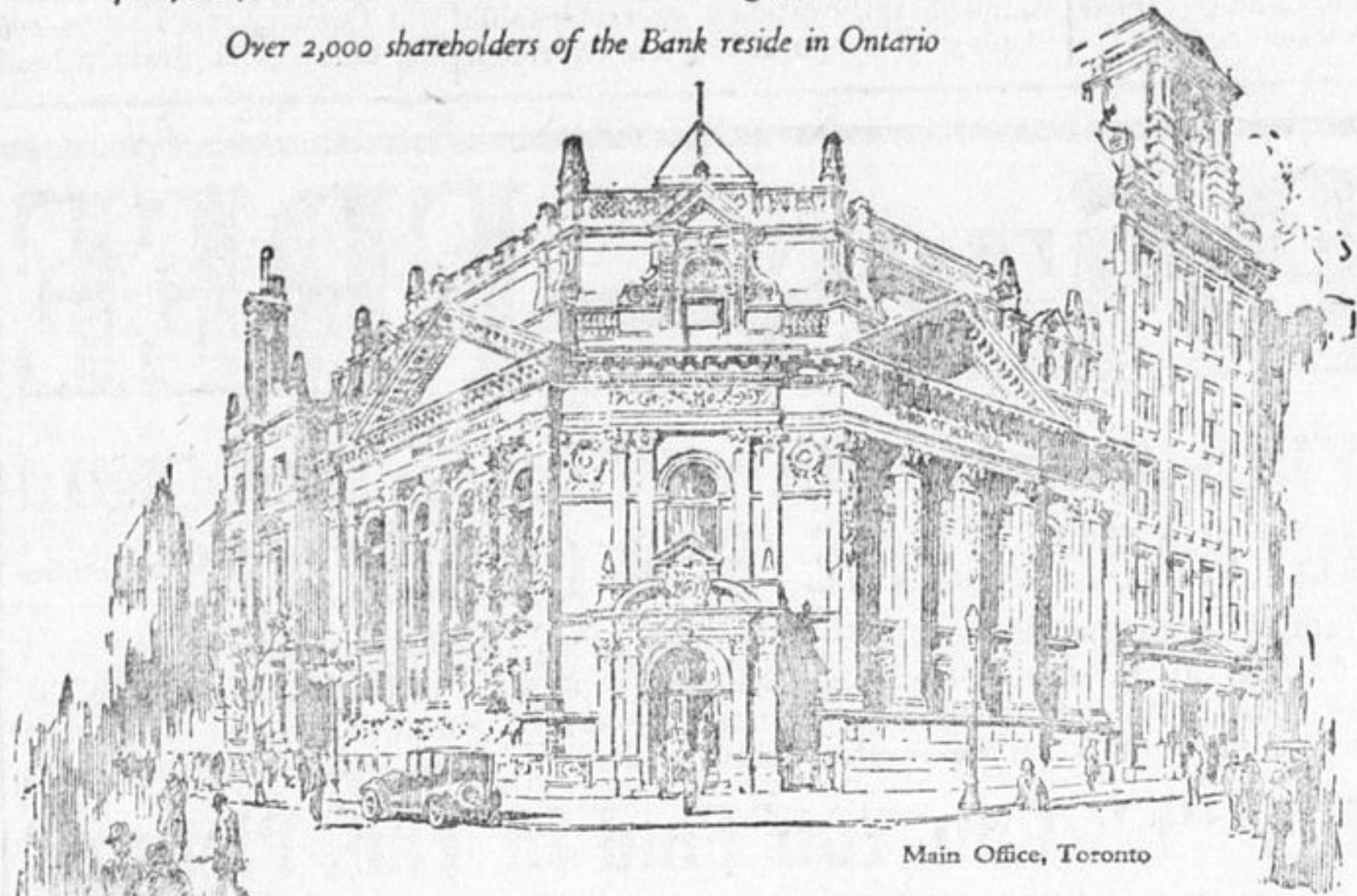
Main Office, Toronto

Over 2,000 shareholders of the Bank reside in Ontario