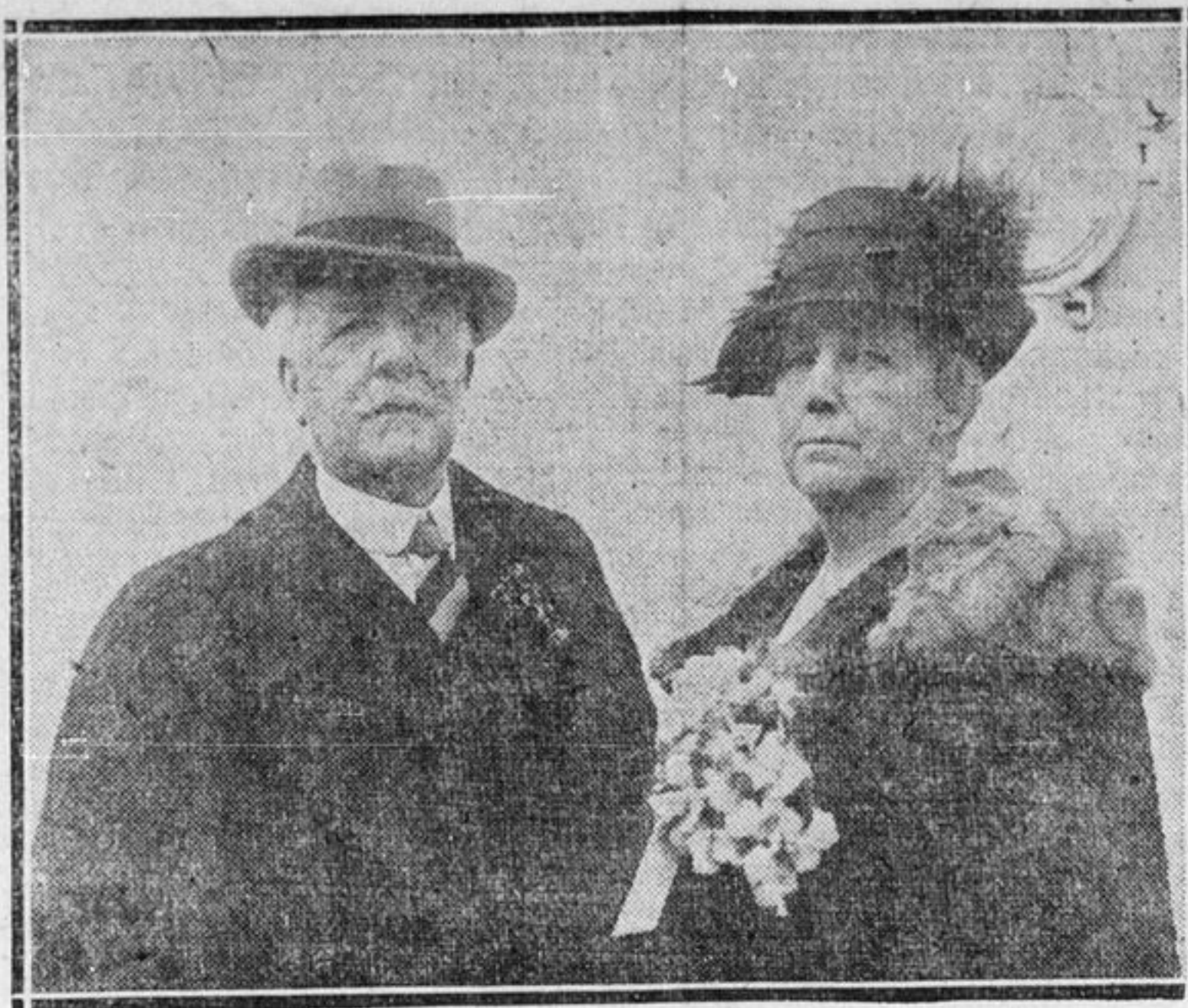
Off on a Holiday

The Curling Club Banquet will be held in the Empire Hotel on Saturday evening, May 30th.