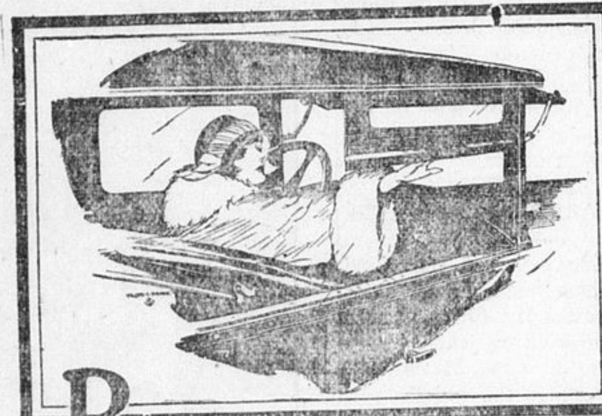
In 30 seconds, it can be converted into a snug, weather-tight closed car. No hunting for torn, ill-fitting curtains. No need to get out of the car.