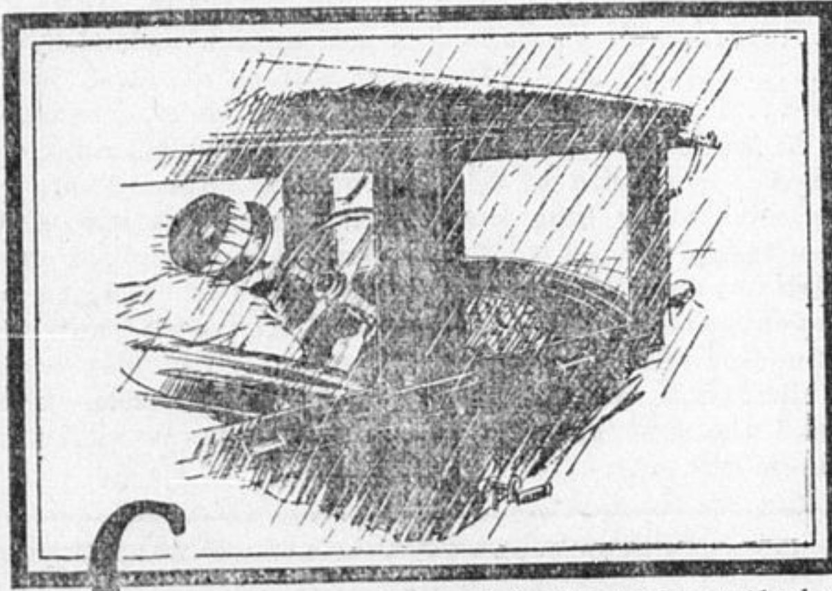
In stormy weather, the Studebaker Duplex provides the protection and comfort of an enclosed car. Only Studebaker builds the Duplex. Six new Duplex models on the famous Standard Six, Special Six and Big Six chassis. Don't buy until you have seen this new type all-weather car. Come in today.