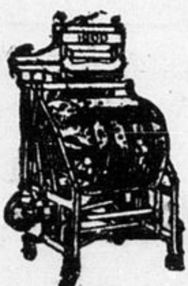
1900 CATARACT WASHER

Saving to you ..... $30.00 $1.00 down and small weekly payments.