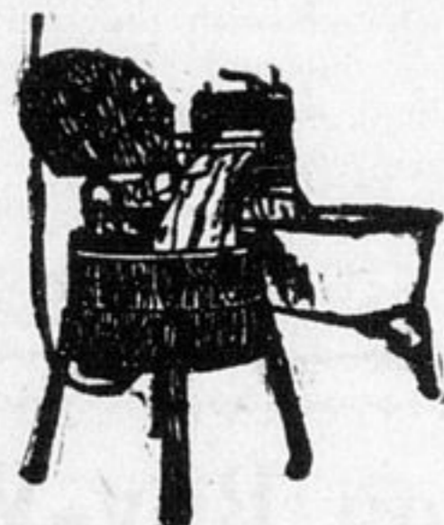
WHITE CAP WASHER

Saving to you ..... $21.00 Payable $1.00 down, $2.50 per week