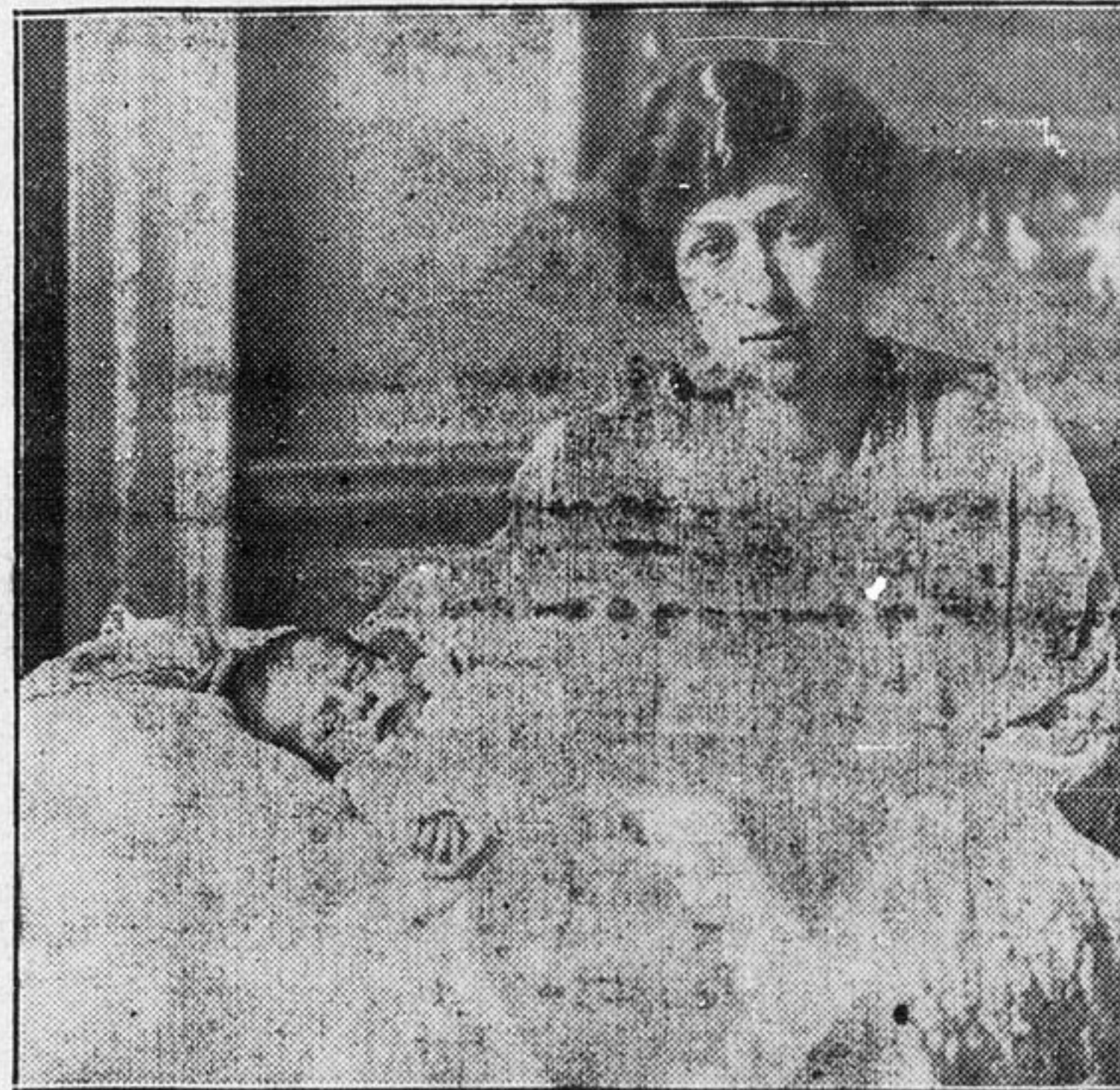
GEORGE HENRY HUBERT HAS A LITTLE BROTHER. Princess Mary gave birth to her second child, a boy, at Goldborough Hall, one of the seats of the Lascelles family, on August 21