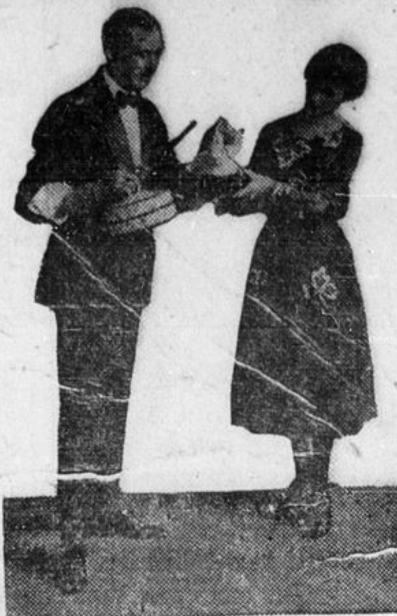
THE MARKO COMPANY

The Marko Company, noted magicians and illusionists, will be one of the feature attractions at the coming Dominion Chautauqua.