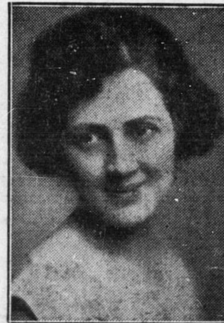
WEDDED INSULIN'S DISCOVERER

Stuart & Sinclair, of Hamilton, have been awarded the contract for the new engine shop to be erected at North Bay for the T. & N.O. Railway. The estimated cost is placed at $75,000.00.