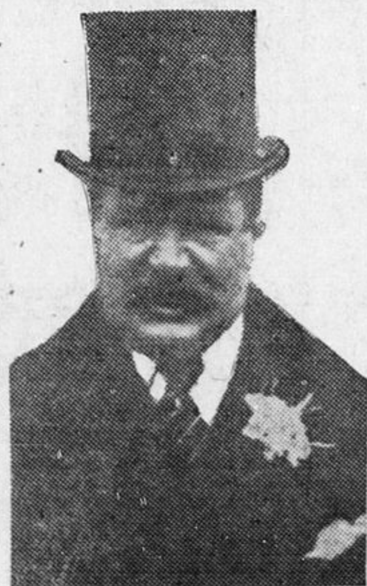
HAPPIEST SPORTSMAN IN ENGLAND

OLD-TIMERS of Cobalt and the Northland generally will be interested in the above pictorial representation of Cobalt in the early days, in the balmy days and in the present days. Cobalt is celebrating its birth and growth by a wonderful Old-Timers Re-Union, June 28th to July 1st. The pictures above are reproduced through the courtesy of the Old-Timers Re-Union Committee.