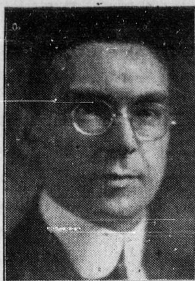
EX-PREMIER WHO TOOK "PRESENTS."

Sir Richard Squires, formerly Premier of Newfoundland, who is reported by a Royal Commission to have accepted "presents" of large sums of money from the Dominion Iron and Steel Company when that company was negotiating with the government which he headed.