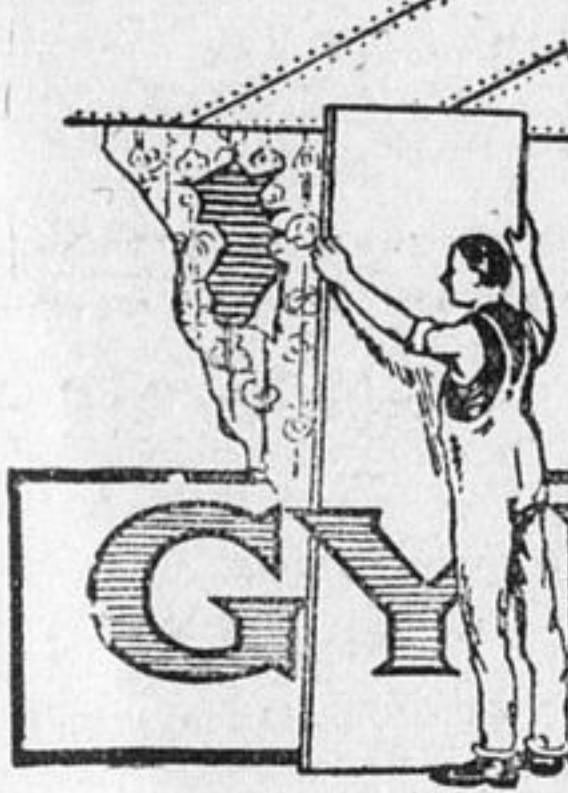
4 to 10 ft lengths 32 wide 3/8 thick

Write for a sample of Gyproc and Booklet.