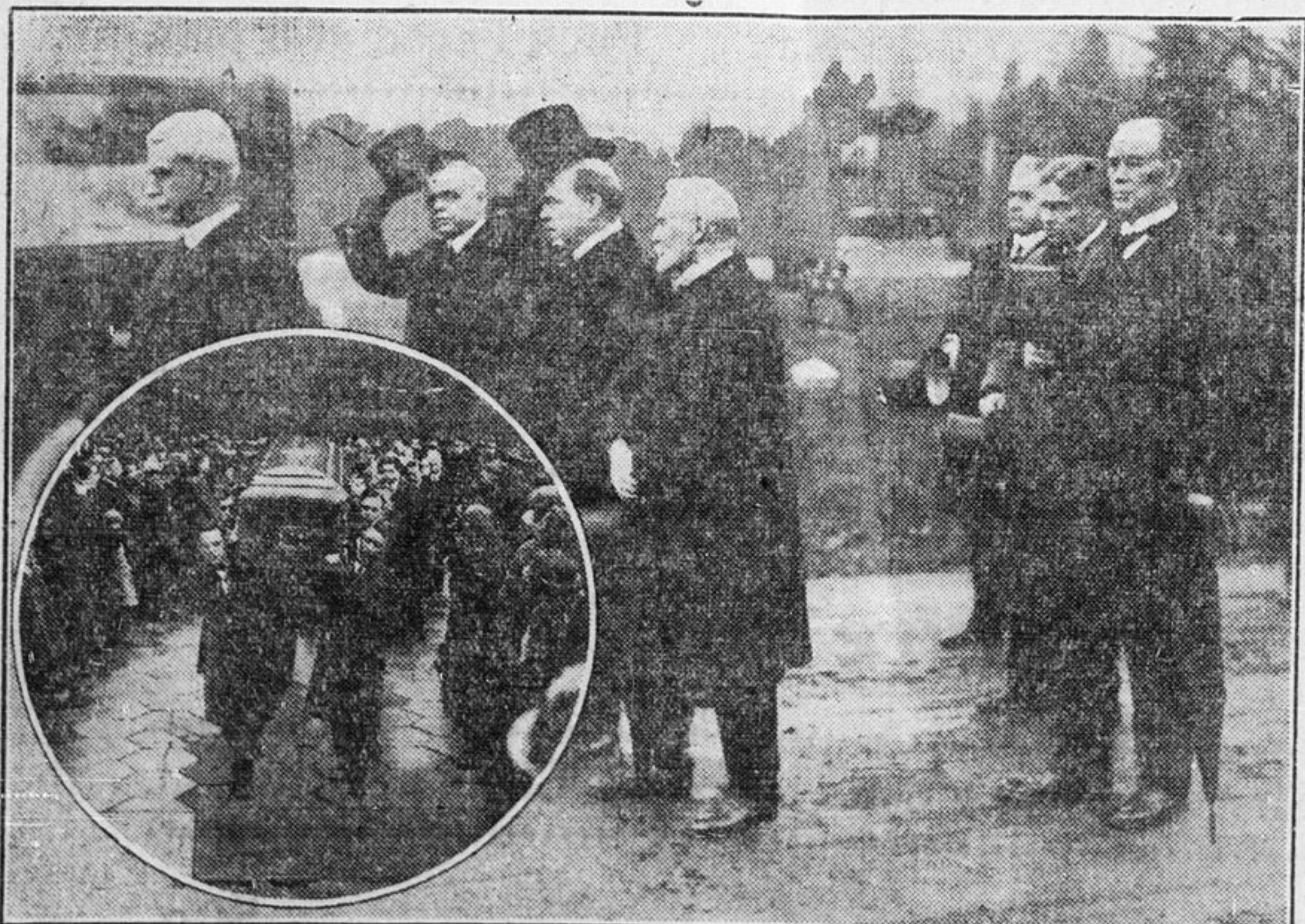
The Premier at Lord Shaughnessy's Funeral

FORD MOTOR COMPANY OF CANADA, LIMITED, FORD, ONTARIO