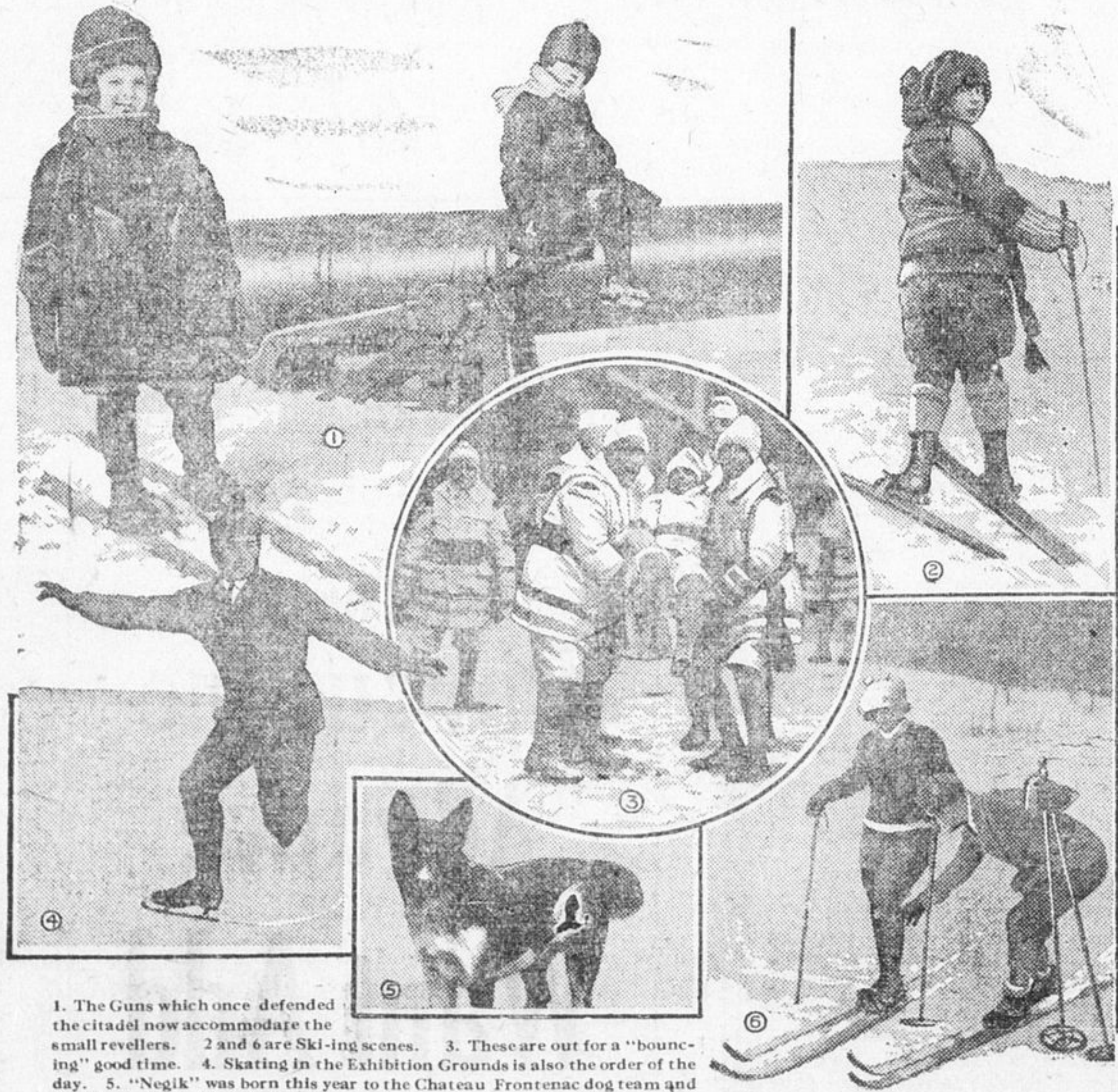
1. The Guns which once defended the citadel now accommodate the small revellers. 2 and 6 are Ski-ing scenes. 3. These are out for a "bouncing" good time. 4. Skating in the Exhibition Grounds is also the order of the day. 5. "Nogik" was born this year to the Chateau Frontenac dog team and he will probably figure largely in the dog race featuring the Winter Sports Program.

QUEBEC is again to have a real, live carnival that shall be truly representative of the wonderful sporting attractions of the ancient Capital. The success of the dog races held in Quebec last year has encouraged the organizers to sponsor a very much bigger program for this year, and a comprehensive series of sporting events will be held on February 21, 22, and 23, in which all the sports for which Quebec is so naturally adapted will be represented, and culminating in a grand masquerade ball at the Chateau Frontenac. In addition to the international races for the Eastern Dog Sled Derby Trophy, there will be events in snow-shoeing, skiing, ice racing, curling and skating. The whole of these events will take place within the Exhibition Grounds, and it is proposed to once again give Quebec an ice palace.