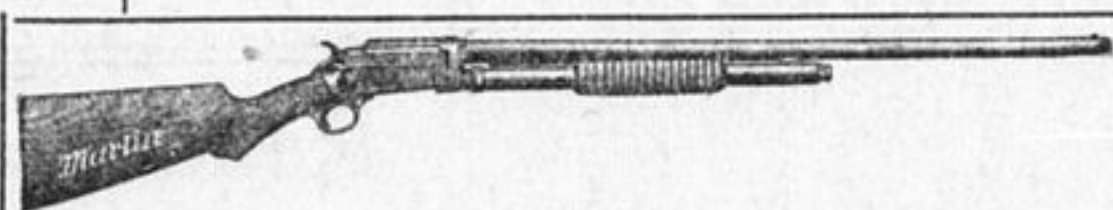
12 gauge Take Down Visible Hammer. 6 SHOTS