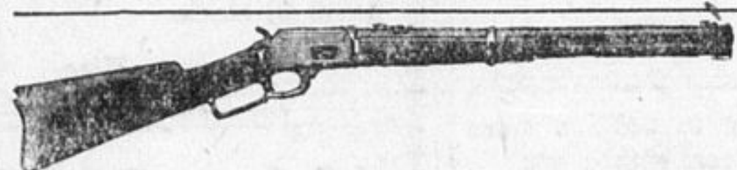
30-30 Carbine 20" Rd. Barrel FULL MAGAZINE—7 SHOTS

We are Headquarters for all kinds of Hunters Supplies