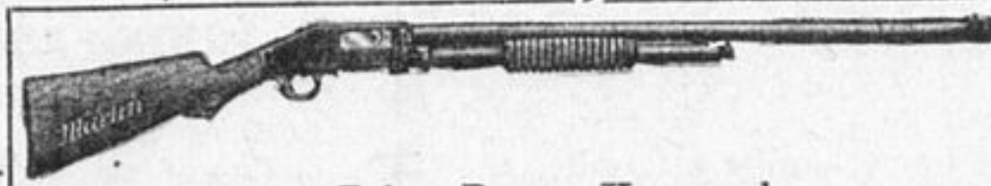
12 gauge Take Down Hammerless. FULL CHOKE—6 SHOTS