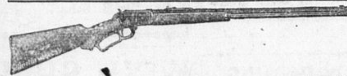
22 Rim—Lever Action 24" OCT. BARREL—25 SHOTS