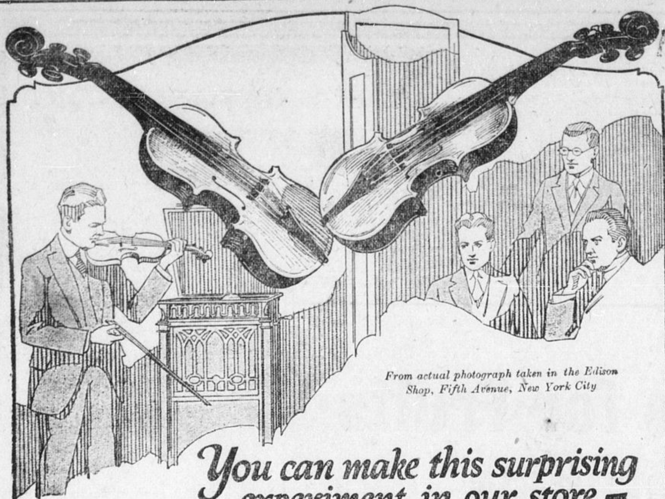
From actual photograph taken in the Edison Shop, Fifth Avenue, New York City